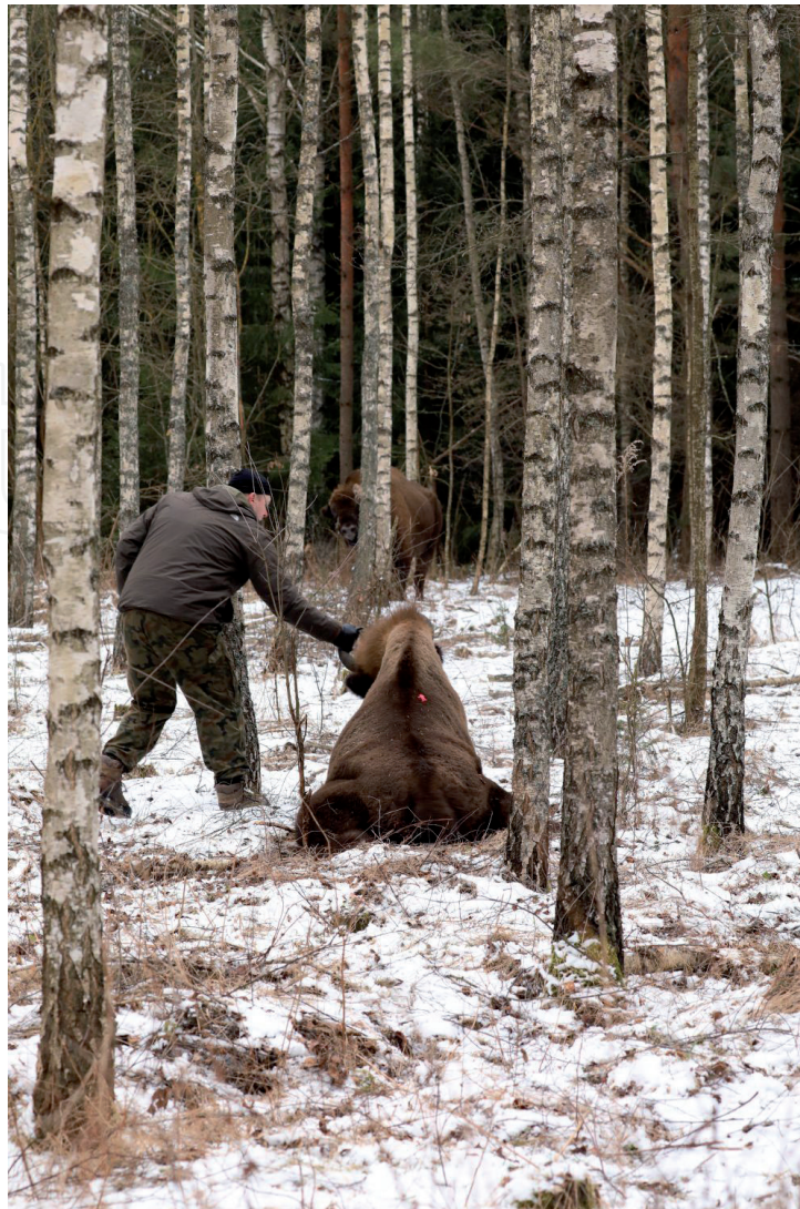
Figure 4. Chemical immobilization of free-living European bison.