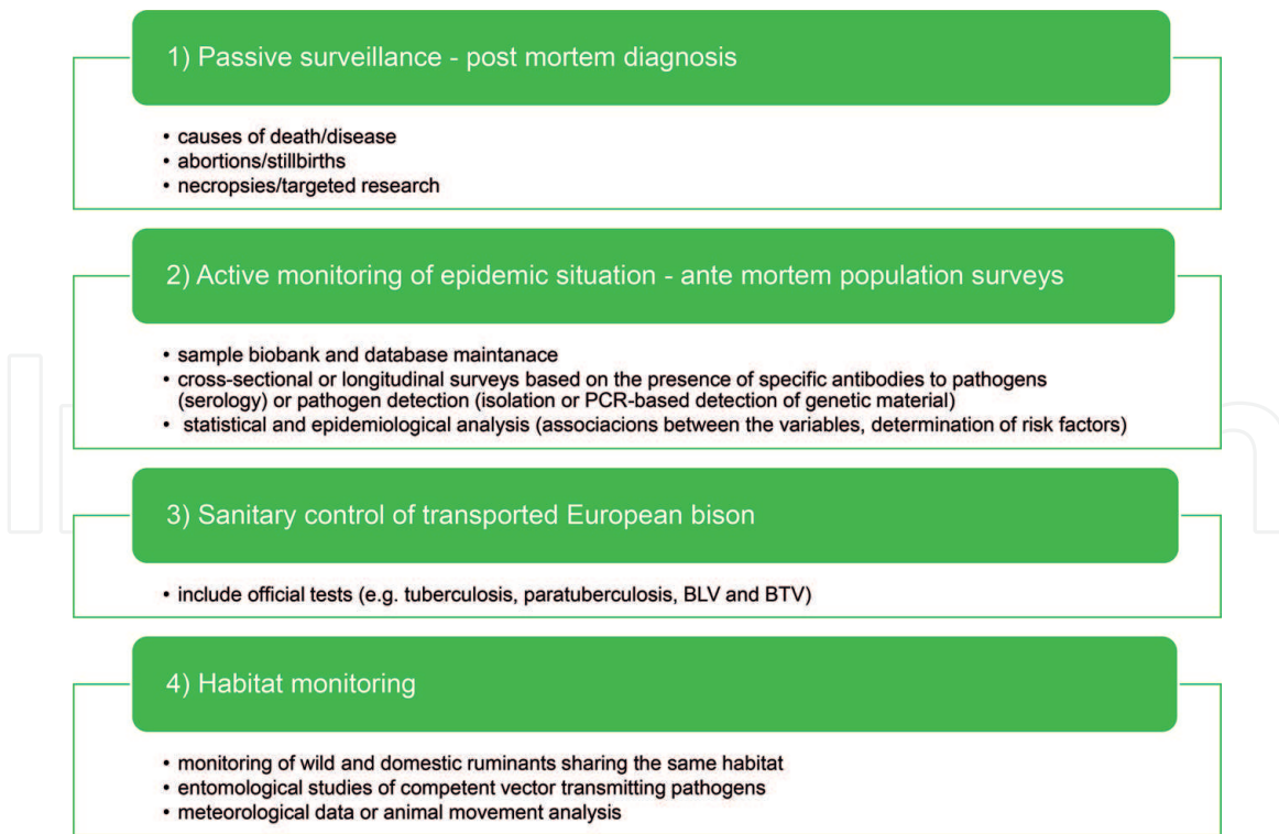
Figure 5. The four main elements of the European bison health monitoring scheme in Poland.