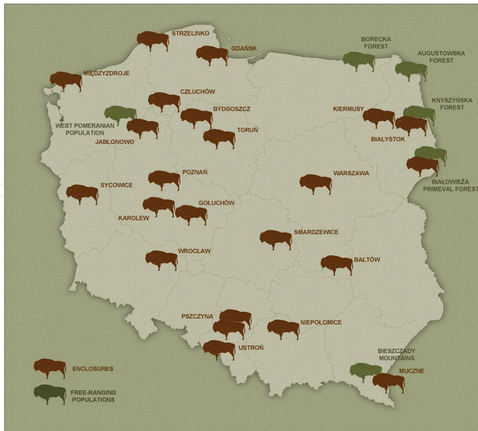
Figure 1. European bison population distribution in Poland, 2018 (graphic design by J. Tomana).

unique pedigree number and a name, specific for the country and place of the origin [3]. Keeping breeding centers allows to control the breeding of European bison by selection of animals with known pedigree and least related. Moreover, breeding enclosures provide a genetic and breeding reserve of pedigree animals in case if any depopulating incidence occurs, what the species had already experienced at the beginning of twentieth century. Therefore, the management of the enclosures needs to be supervised by a veterinarian. Each movement of animals between breeding centers should be preceded by a clinical examination of the animal; a laboratory test for the most important infectious diseases and prophylaxis (more often therapeutic in practice) against ecto- and endoparasites should be applied [7].