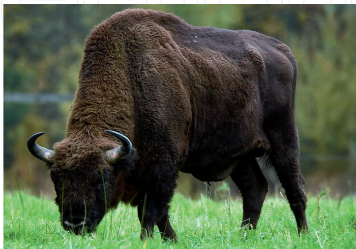
Figure 3. Male Bison bonasus with clinical signs of balanoposthitis showing symptoms of impeded urination (stranguria) and swelling of the whole external genital area (photo: Ł. J. Mazurek).

One of the most devastating bacterial diseases, which remains a current problem in Polish European bison populations, is tuberculosis. The disease was diagnosed in the free-living European bison population in the Bieszczady mountains in the 1990s [28–31], European bison are very susceptible to mycobacterial