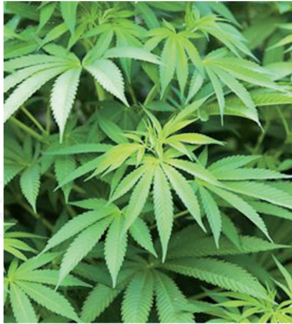
Figure 3. Cannabis sativa.

HIV-infected persons [96] and other conditions [39]. It is used as a decoction or infusion, alone or mixed with other herbs and taken daily as a preventative medicine, and it would be obtained from THPs [39, 94]. The legalisation certainly provides an environment for continued use of the plant as ATM and obligates that more research should be done to explore further benefits of medicinal cannabis. Hence, the regulations around granting licence for research may need to be reviewed in light of the ruling ( Figure 3 ).