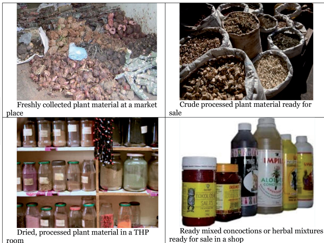
Figure 2. Plant material in various stages of the production: from collection to point of use as a ready-to-use mixture.

measures of the handling of the herbal mixtures during production, storage and dispensing. The South African Health Products Authority (SAHPRA), through its working group, is working on the draft framework for the regulation of ATMs produced for bulk sale [118], and these studies should serve as a guide for fast-tracking the processes (Figure 2).