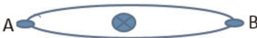
Figure 2 Two non-homotopic trajectories due to a point singularity between them.