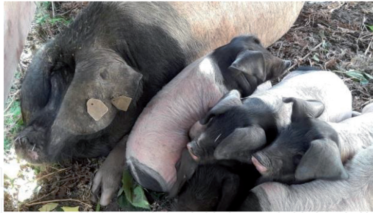
Figure 2. Sow of Basque breed with piglets.