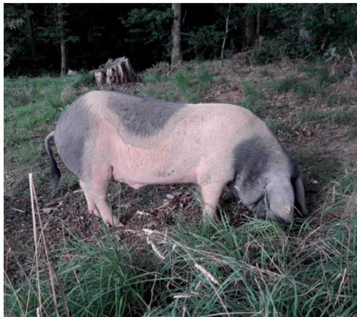
Figure 3. Boar of Basque breed.