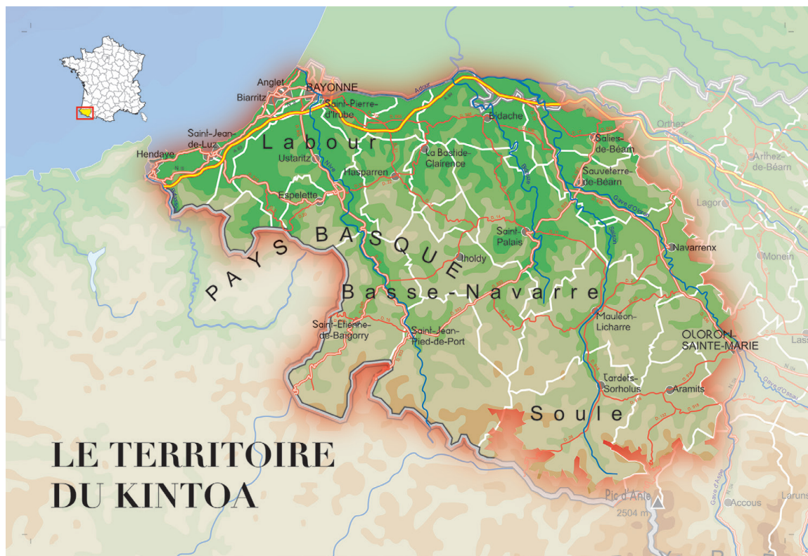
Figure 4. Geographical localisation of the production of Basque pigs for the Kintoa protected designation of origin in France (BDCARTO-IGN, MAPINFO, INAO, 2014).

and 25 pigs/ha forest. Plot lands must be approved by the authorities responsible for quality sign management and control. Plots include a shed, water access and a feeding area. In addition to natural feeding resources that correspond to around 50% volume of feed intake, pigs are fed with complementary (without GMO) food up to a maximum of 3.2 kg per pig and per day between 3 and 8 months of age and 2.7 kg afterwards. From weaning, the allowed foodstuffs include wheat, corn, barley, rye, triticale, sorghum, oats, peas, faba beans, lupine, vetch, flax (as seeds or derived products), soybean, sunflower and rapeseed (as seeds, meal or oil), cane or beet molasses, alfalfa, beet pulp and whey only up to 2 months before slaughter.