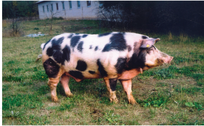
Figure 3. Lietuvos vietinė boar.

black spots on the body, but colour variations include black and white, ginger, black and tricoloured ( Figures 2 and 3 ). They have a friendly temperament. Being insensitive to the sun, these pigs are suitable for grazing.