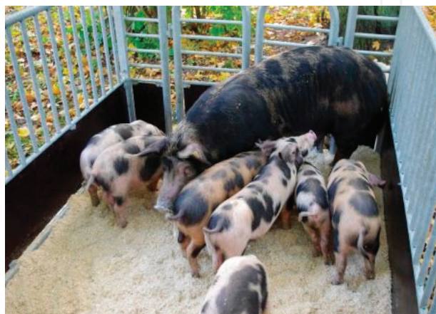
Figure 2. Lietuvos vietinė sow with piglets.