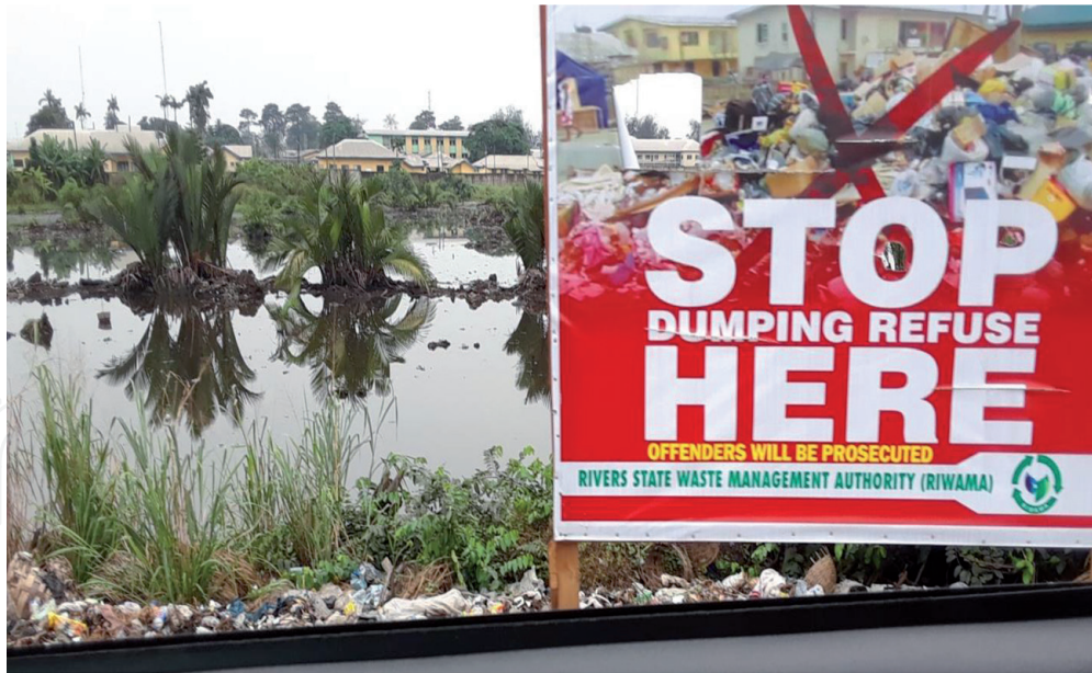
Figure 5. Enlightenment campaign against waste disposal in rivers and a mangrove forest at Eagle Island, Niger Delta, Nigeria.

proper city planning and employment of skilled waste managers, which go beyond what an individual can do. However, the government is well positioned to execute such gigantic projects. For government to acquire land and to use the state's resources to establish waste facility will not be a problem as compared to what an individual will do. For example, because of the land use system, land acquisition by a private person is more cumbersome and costly than when done by the state government.