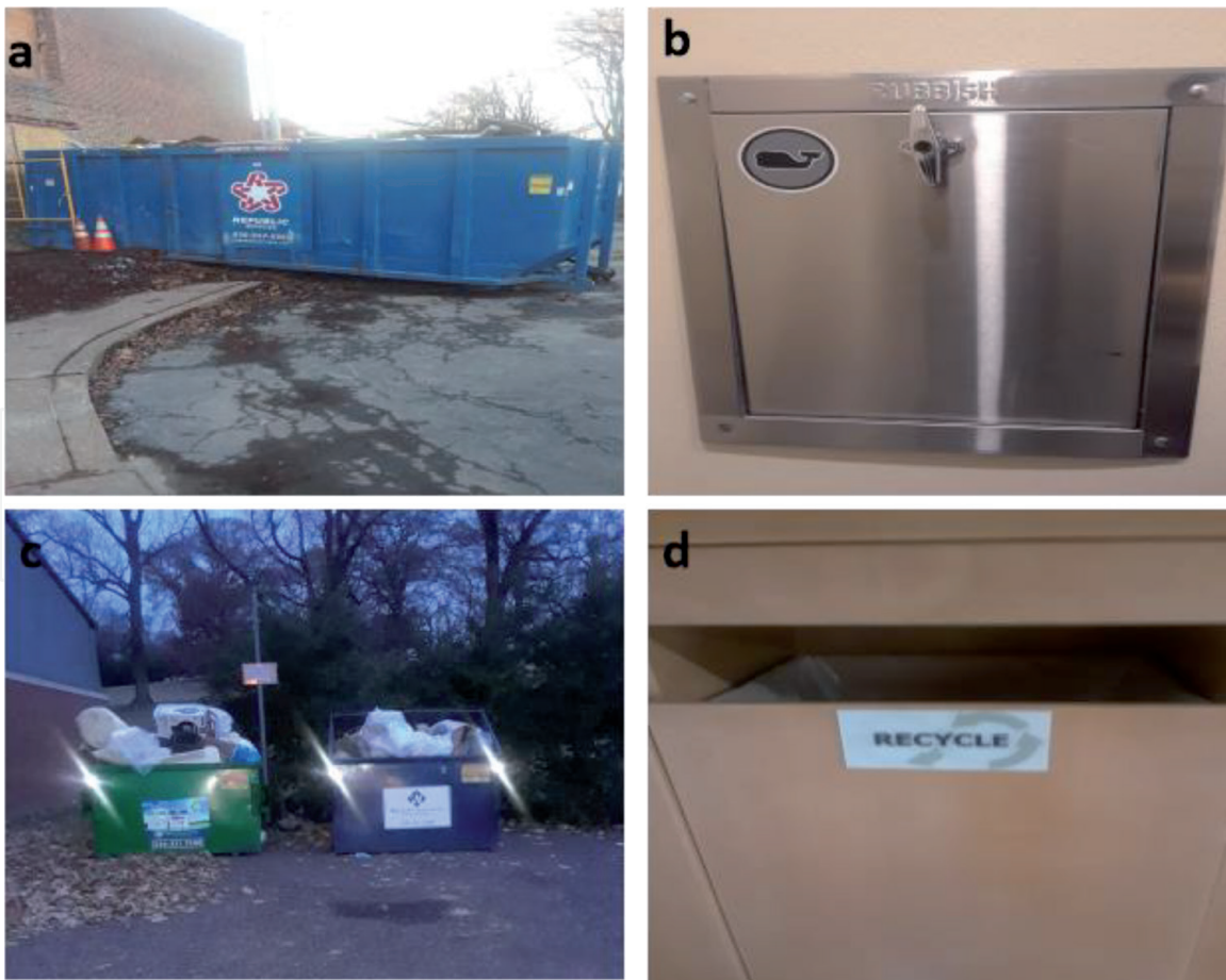
Figure 3. (a) Giant silo bin used to collect and convey building waste at a building renovation site. (b) Indoor waste disposal unit installed in a room to collect house hold waste, which will be channeled out into a silo bin placed outside for onward collection and disposal by waste agent at a building facility in Saint Louis USA. (c) Type I (rubbish, e.g., paper) waste collected and sorted for recycling (green silo).

There is no waste sorting culture in the region, which creates problem in the effective management of waste. This is because collected waste at different sites are all mixed up at home by residents and dumped by the road side for collectors to pick. There is no separation of waste into different types as practiced in developed societies ( Figure 3a, c ). Lack of waste separation creates problem for collectors who do not have the training or the equipment for separating the waste into its parts before final disposal in landfills [18]. Gross ignorance and helplessness in waste management had made a lot of people to become waste distributors, who pass on waste from one place to another in the name of management. They do this by pouring waste in restricted places under the cover of darkness or sometimes in the open without being confronted. Favorite areas of waste disposal in some cities in the