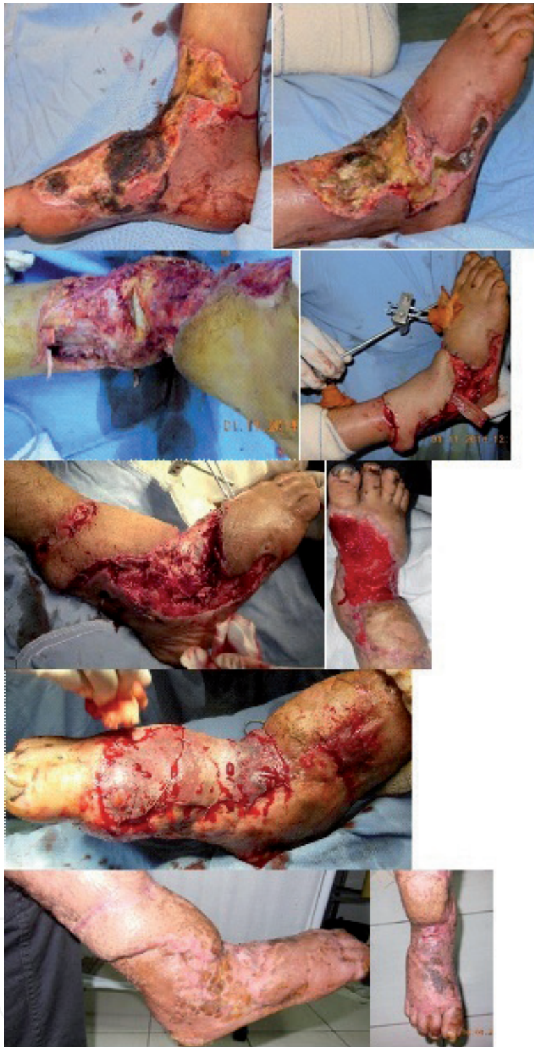
Figure 5. High voltage electric burn. Excision 7 days after burn with osteoarticular exposition. Use of sural flap, vacuum-assisted closure therapy and skin grafting.