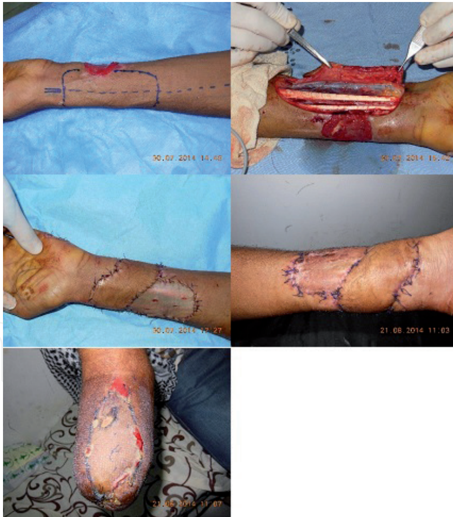
Figure 4. High voltage electric burn. Radial artery perforator flap for the left upper limb. Right upper limb amputation.

reduce the frequency of dressing changes and the exposure time. The application of a VAC system requires that the debridement phase should be completed. It accelerates the granulation phase and shortens the duration of hospitalization. In addition, we preserve this technique with deep and small skin defects ( Figure 5 ).