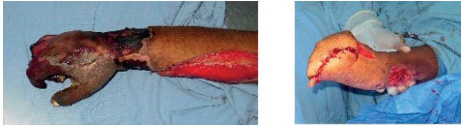
Figure 2. Hand necrosis. Amputation.

treatment, and on the healing of various lesions, modality and deadlines remain controversial.