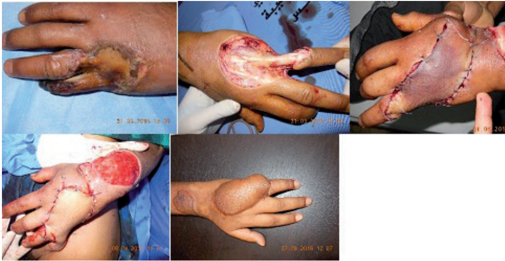
Figure 3. Low voltage electric burn. Necrosis of the fifth finger. Excision 6 days after burn. Immediate coverage by local flap. Partial necrosis of the flap. Groin flap.