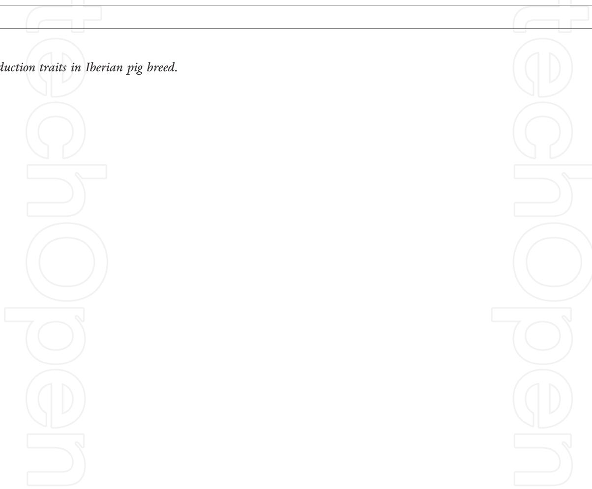
Table 2. Summary of collected literature data on reproduction traits in Iberian pig breed.