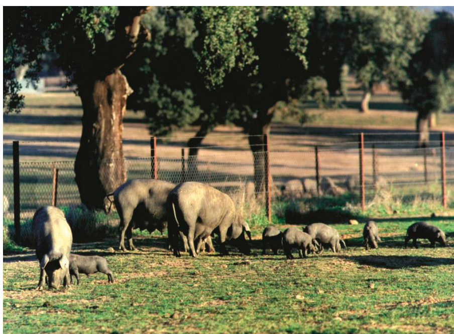
Figure 2. Iberian sow with piglets.