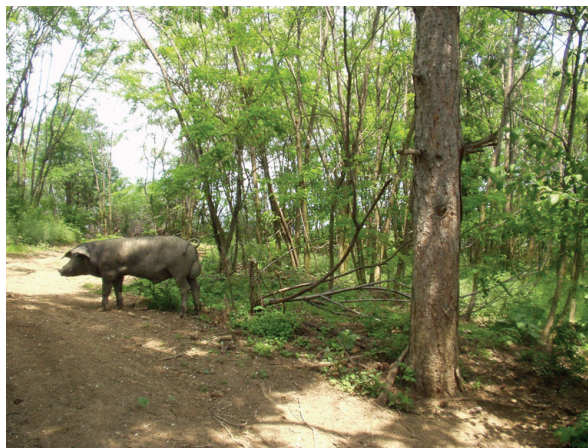
Figure 3. Moravka boar.