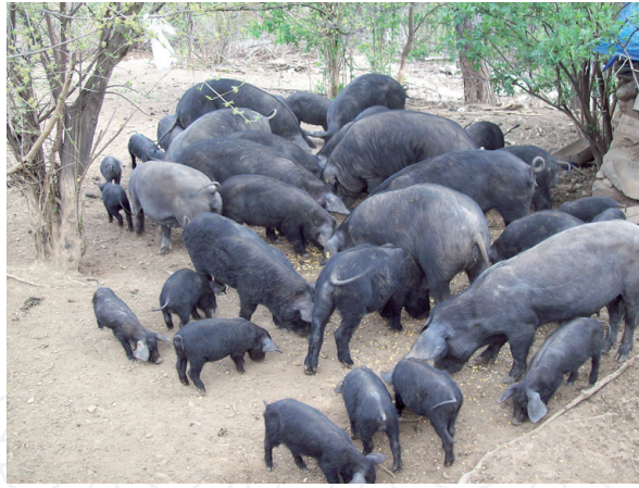
Figure 2. Moravka sows with piglets.