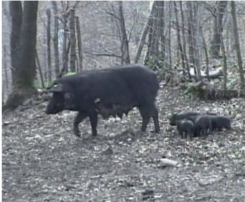
Figure 2. Nero Siciliano sow with piglets.

animals, with consequent conservation of an interesting genetic variability. Since 2001, the conservation programme involves a group of companies that adopt the traditional extensive breeding techniques which usually foreseen to let the pigs in forest, if present, during all the year. Depending on climatic conditions the period in the forest could be limited to autumn-winter or spring-summer seasons. The pig breeding has always been present in the farms of the region with the function of recovery and reuse of waste and for their ability to produce supplementary income. It is bred with a fully extensive system by reproducing itself in the bush without any particular precaution using the resources made available by the pastures and the forest. A study of Aronica et al. [4] showed that almost all the farmers (88%) are only responsible of the breeding, whereas other professionals are in charge of processing and selling products.