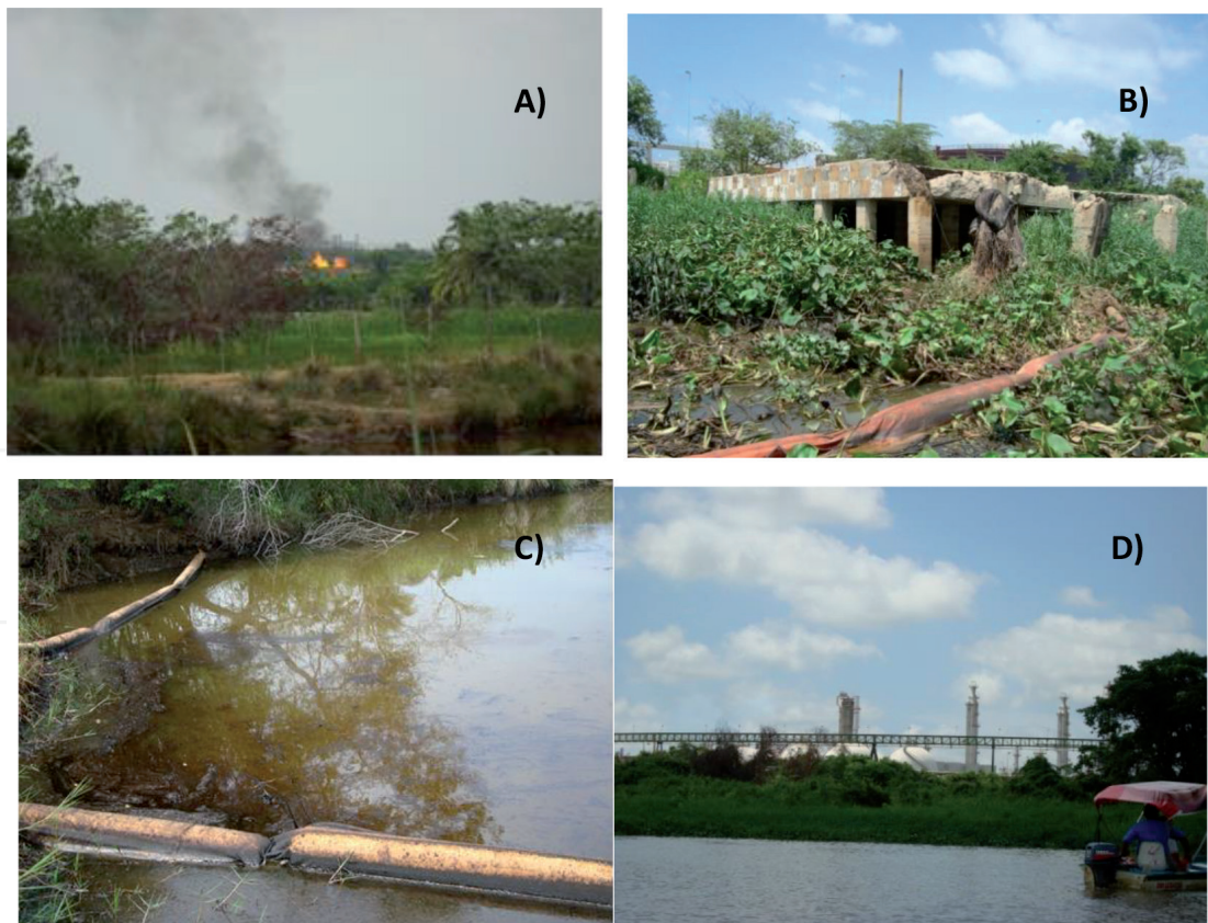
Figure 2. (A) Burning of waste by the petrochemical La Venta, Tabasco, Mexico; (B) sludge in contaminated sites in La Venta, Tabasco, Mexico; (C) petrochemical complex of Minatitlán, Veracruz, México; (D) Santa Alejandrina reservoir adjacent to the Minatitlán petrochemical complex, Veracruz, Mexico.

On the other hand, oil also has various effects on plants due to the changes they produce in the soil; oil can inhibit water retention, causing reduction of germination, emergence, growth, and accumulation of biomass, and cause nutritional imbalance, reduction in pasture production, and, therefore, lower percentage of livestock hectare.