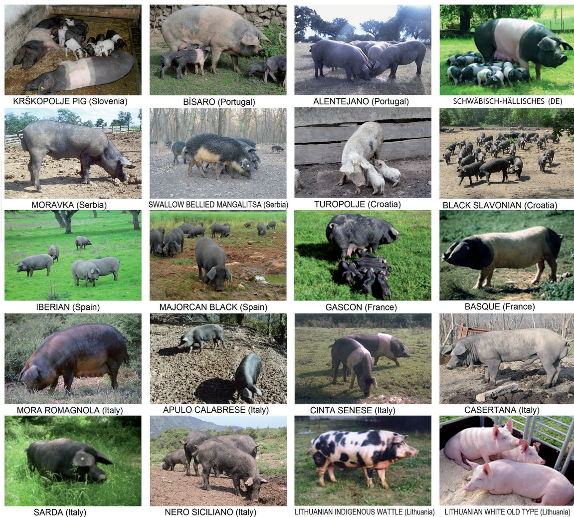
Figure 1. Local pig breeds studied in the project TREASURE.

In order to improve the supply and their market potential, it is essential to acquire more scientifically based knowledge about their genetic singularity and adaptive capacity, to evaluate different management practices, their nutritional requirements and use of local feeding resources, the impact on environment, and to evaluate their socio-economic merit.