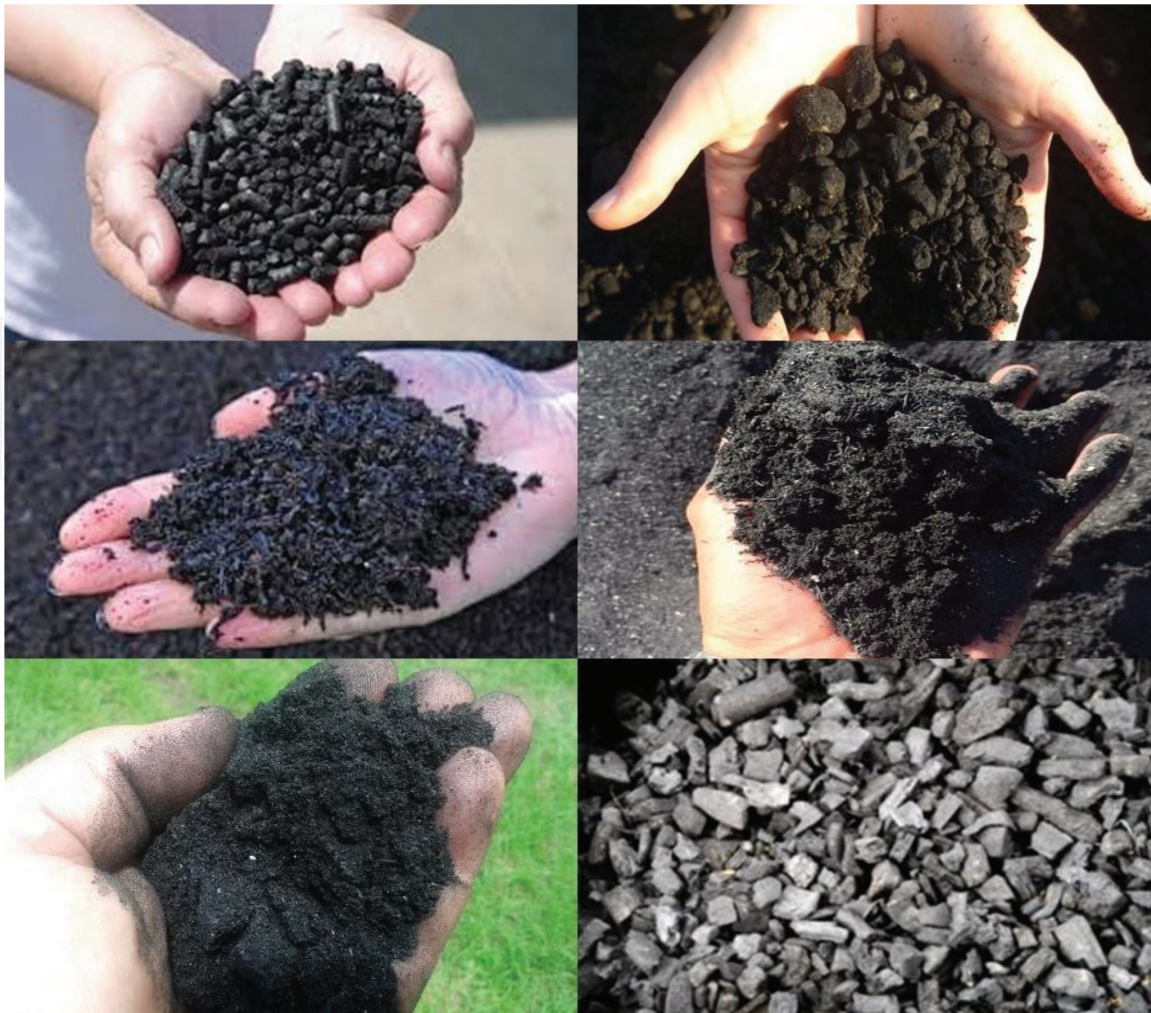
Figure 1. Biochars from feedstocks with different particle sizes.

dimensions, stirring regime, catalysts, etc.), pretreatment (drying, comminution, chemical activation, etc.), the flow rate of ancillary inputs (e.g., nitrogen, carbon dioxide, air, steam, etc.), and posttreatment (crushing, sieving, activation, etc.).