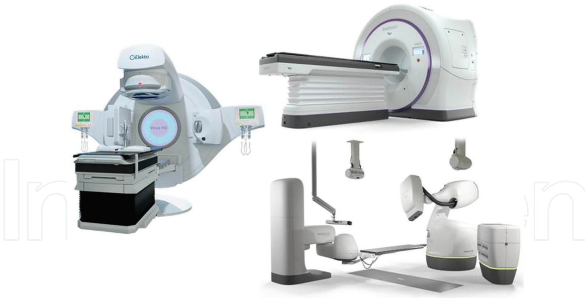
Figure 1. Commercial treatment delivery units. From left to right are versa HD (Elekta AB), Radixact (Accuray Inc.), and CyberKnife M6 (Accuray Inc.).