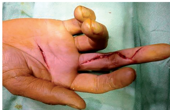
Figure 1. Bruner's incision with palmar incision to expose the tendon stumps.

With an L-shaped incision (Lister's technique) the digital flexor tendon sheath is opened in between the annular pulleys [9]. to prevent bowstringing Annular pulleys (especially A2 and A4) should be spared and repaired if they are traumatized. The sheath should be closed using a fine suture material after completion of repair of severed flexor tendon. In case of severe damage to the sheath, it may be necessary to excise the portion of the sheath over the repaired tendon site to prevent trigger finger or an impingement. In cases where tendon injury is not a result of sharp cut, the tendon ends need to be refreshed using a sharp blade, this debridement should be minimal to avoid any tension over the tenorrhaphy site. A needle can be used to fix proximal end in place while performing tenorrhaphy, this allows tension free approximation of two injured tendon ends ( Figure 3 ).