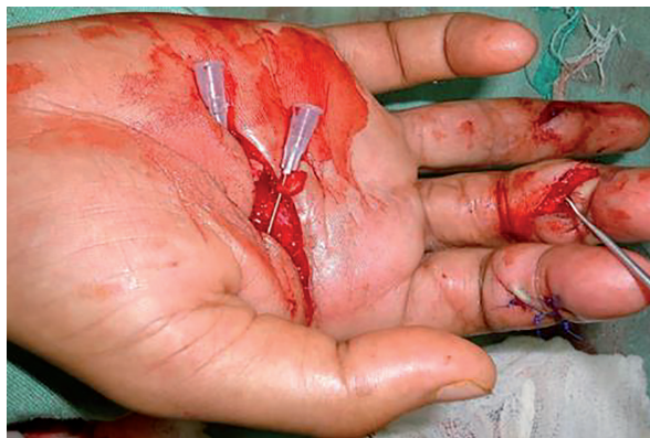
Figure 3. Temporary fixation of the proximal tendon stump with a needle to facilitate repair.