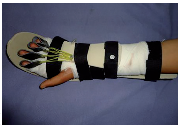
Figure 4. Kleinert's technique for passive flexion and active extension.

For first 4 weeks controlled passive motion is used, by the hand therapist, twice a day with each session of six to eight motions for each tendon. This method uses 3–5 minute exercise movements at the repair site for preventing any firm adhesion formation. For a week, a rubber band traction is attached to the wrist and active exercises are done for 2 weeks with dorsal blocking splint in place.