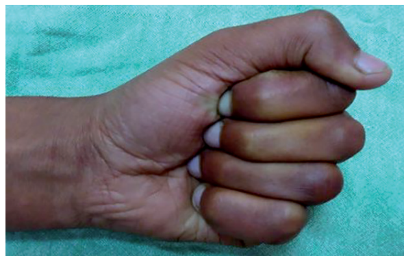
Figure 7. Result in flexion after 6 months of modified Kessler suture and Kleinert's rehabilitation.