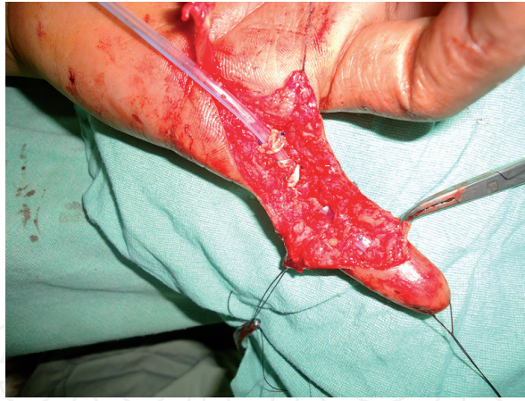
Figure 2. A silicone tube to bring the proximal tendon stump to the desired level to avoid potential formation of adhesions.