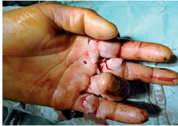
Figure 6. Flexor tendon injuries in zone II, Bunnell's "no man's land".