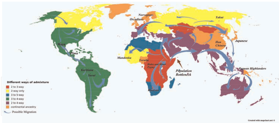
Figure 2. A partial worldwide admixture painting map. The figure shows several worldwide admixed populations with patterns identified through published paper on population structure from 2008 to 2018. The population migrations within and between continents have resulted in different admixed populations ranging from one- to five-way admixtures.

treatment [16]. The date of admixture in a given population can be predicted by analyzing the ancestral track, break-points, and linkage disequilibrium (LD) [17]. Also, distinction between date of admixture events is made with the use of LD and ancestral tracts in the admixed genomes [17]. Nowadays, there are several models for predicting the age of an admixture event, which are classified into two main groups: LD-based approaches and haplotype-based approaches [17, 18]. These models use information from genomes of several population groups around the world as representative or equivalent ancient populations known to influence the migration and/or admixture processes, yielding observed admixed population patterns worldwide (Figure 2).