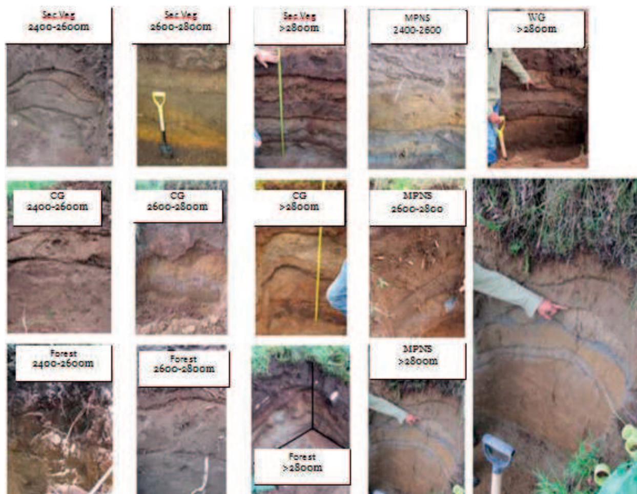
Figure 1. Mosaic of soil profiles in pits for different cover systems and at different altitude ranges in volcanic soils in Colombia (secondary vegetation; pasture mosaic with natural spaces; weeds; weedy grasses; clean pastures; and high, dense forest mainland).