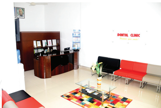
Figure 3. A patient-friendly dental clinic reception.