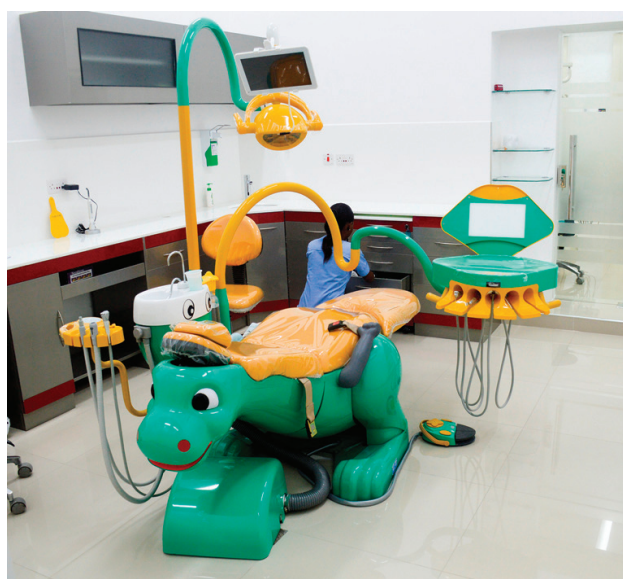
Figure 4. A child-friendly dental surgery (picture by Jacob Francis, courtesy of Smiles dental clinic).

be effective in reducing state anxiety [49]. Similarly, SDE, which has been utilized and proved to be effective for management of dental anxiety, is also helpful in reducing the anxiety and relaxing the patient [45].