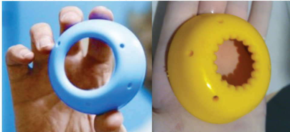
Figure 2. Comparison between the Arabin cervical pessary (blue) and the AM-Ingamed cervical pessary (yellow): They are similar regarding design, size, and texture. The dimensions (largest lower diameter × smallest upper diameter × height) of the most frequently used Arabin pessary are 70 × 32 × 25 mm, and of the Ingamed cervical pessary the dimensions are 70 × 30 × 25 mm.

Pregnant women (n = 137) with a sonographic cervical length ( \leq 25 mm) were randomly selected to receive an Arabin cervical pessary ( Figure 2 ) or expectant management (1:1 ratio). SPB < 34 weeks of pregnancy was significantly less frequent in the pessary group than in the expectant group (16.2% vs. 39.4%); relative risk, 0.41. No significant differences were observed in composite neonatal morbidity outcome (5.9% vs. 9.1%); relative risk, 0.64. No serious adverse effects associated with the use of a cervical pessary were observed or neonatal mortality (none) between the groups.