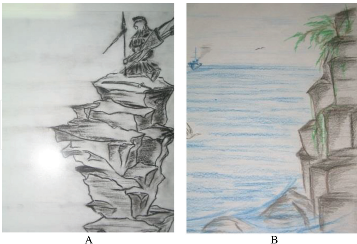
Figure 2. (A) Combatant M—Before treatment. Diagnosis: PTSD. (B) Combatant M—in a month of therapy.