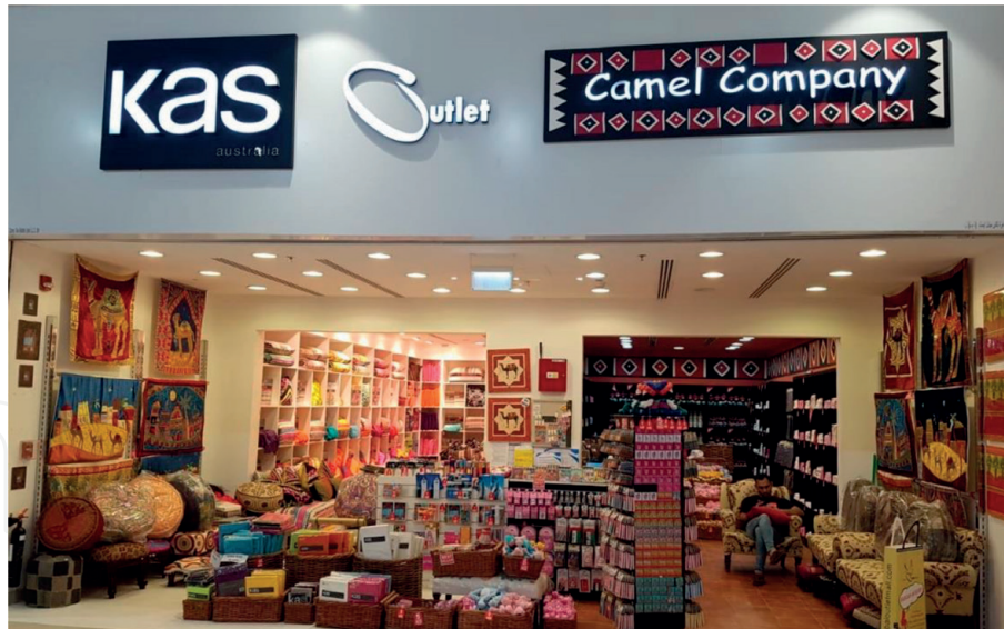
Figure 3. Camel milk based products in Australia.

Australia (Australia). Large camel farms are being established, and increased funding for camel research is noticed. Moreover, a wide variety of camel milk-derived products are now available in the market, including various new dairy products, such as pasteurized milk, fermented milk, flavored milk, butter, cheese, and milk tea [37, 38]. As a specific example, Bactrian camel milk is used for making cheese, butter, and yogurt in Mongolia [13]. Traditional fermented camel milk is produced and consumed in several countries, such as, Shubat (Turkey, Kazakhstan, and Turkmenistan), Suusac (Eastern Africa, Kenya, and Somalia), and Garis (Sudan and Somalia). Despite the effort made by researchers to produce yogurt from camel milk, the manufacturing of this by-product needs more study due to the fact that camel milk does not easily coagulate [39]. In Dubai, a coffee shop business specializing in different hot and cold drinks and pastries made with fresh camel milk called “Cafe2go” was set up recently. Since 2011, it has expanded successfully to 10 locations in Dubai and Pakistan and is soon to be opened in Oman and Saudi Arabia. Furthermore, camel milk utilization is not limited anymore to the producer region only, but it is now marketed overseas also. It has recently been exported from the United Arab Emirates to the European Union [40]. Furthermore, recent studies have investigated the optimization of fermentation processes [41] and cheese-production from camel milk [42].