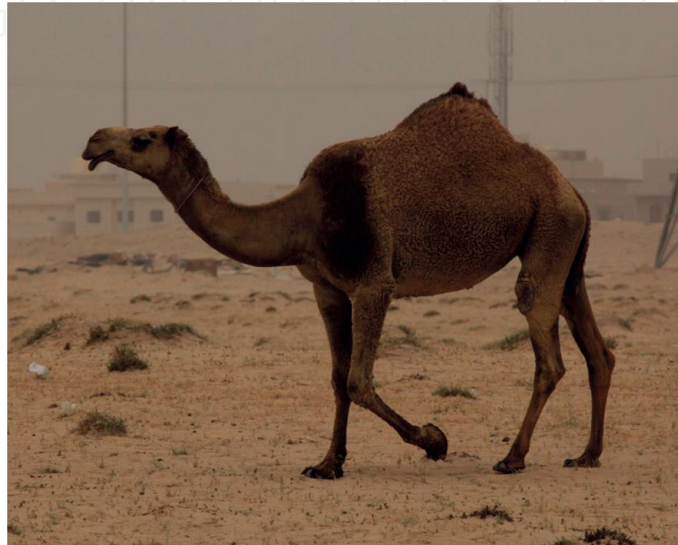
Figure 1. Dromedary camel.

by the Bedouins (people who inhabited the desert) where access to green vegetables and fruits is limited, thus providing, in that case, a significant nutritional relevance. Although camel milk is linked to the culture identity of Bedouins for a long time, small-scale and large-scale farms for intensive production of camel milk have been implemented worldwide only in recent years. The establishment of these farming systems was synchronized with the increased consumer's interest in unprocessed raw non-bovine milk consumption. While cow milk represents 82% of the total quantity of milk produced in the world, non-bovine dairy species provided 133 million tons in 2016 [1]. Camel is considered one of the most important dairy animals contributing to about 0.3% of the milk produced in the world [1] (Figure 2). Raw camel milk has