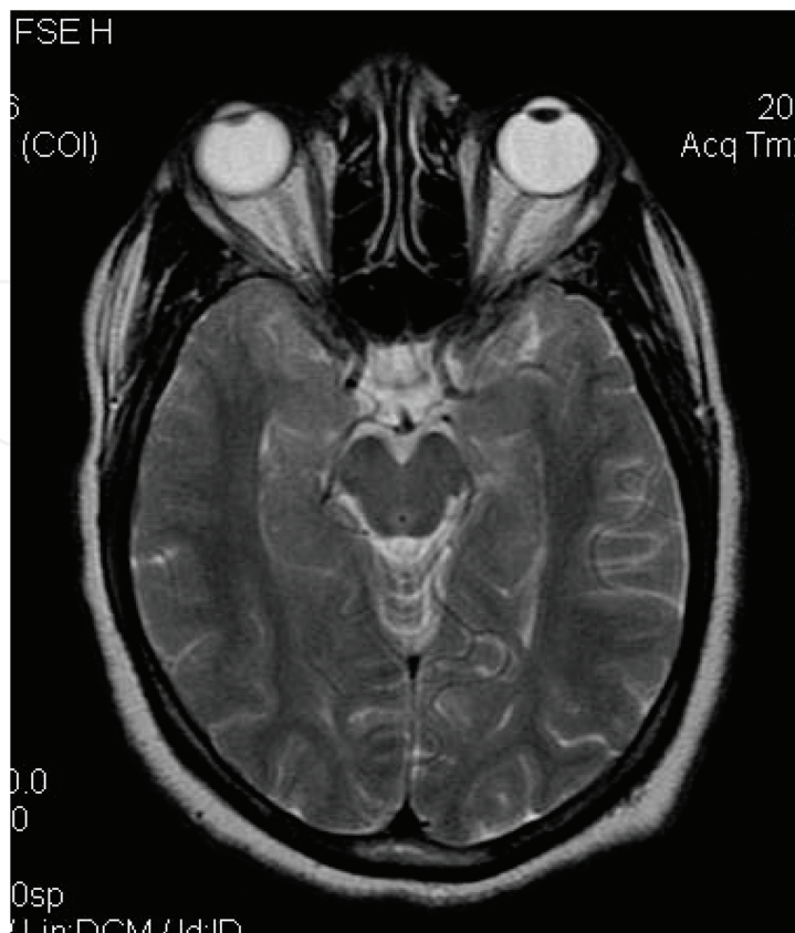
Figure 2. Blindness secondary to cerebral occipital cortical edema.