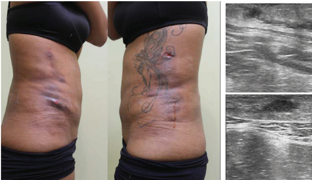
Figure 3. M. chelonea after liposuction.

after breast surgery. Facial surgery is rare but compromises long-term results. Most patients are reluctant to hemotransfusion. It is possible to correct moderate anemia without hemodynamic compromise with iron, folic acid, and erythropoietin. Figure 4 shows typical cases of bleeding that may complicate the definitive outcome of surgery.