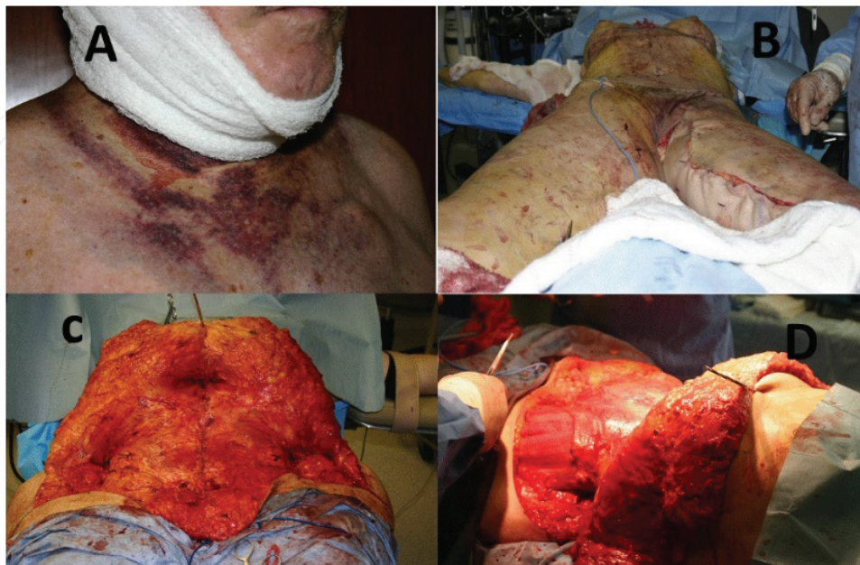
Figure 4. Transoperative active bleeding and residual postsurgical hematomas.

Nerve ending injuries are common in liposuction and abdominoplasty and manifest as neuropathic pain. Preventive use of gabapentinoids is useful. Major nerve damage can be seen