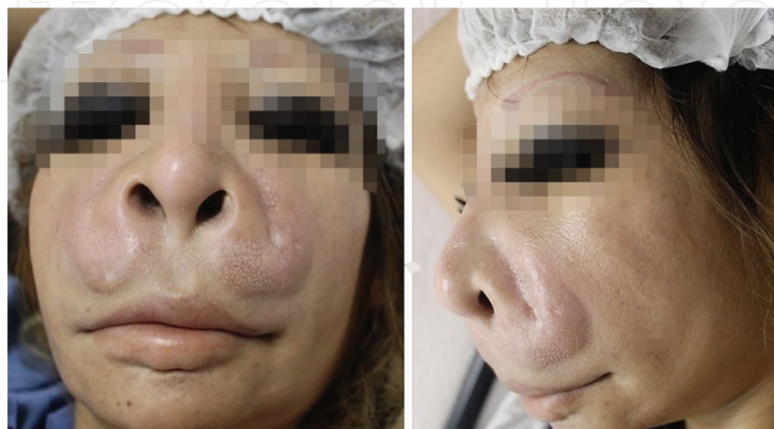
Figure 5. Severe facial deformities secondary to an unknown illegal filler.

Soft tissue volumetric augmentation with filler injections is the second most frequent non-surgical procedure performed in plastic surgery, being the face and buttocks the areas more frequently injected. The increased use of a wide range of fillers has shown that they are not harmless, so it is crucial to briefly review possible complications. The transfer of autologous fat in the facial regions is the most used filling substance. There are a great variety of synthetic fillers that can be atoxic and nonimmunogenic or act as a foreign body and induce an immune reaction, granulomas, infections, fibrosis, and long-lasting or permanent body deformities [83–85]. Although very rare, transient or permanent blindness and cerebrovascular emboli are the most devastating complication of forehead and facial injection of synthetic fillers or autologous fat. It is believed that the injected filling can act as a retrograde embolus upon entering the ophthalmic artery or through the normal anastomosis between frontal branch of superficial temporal artery from external carotid artery and supraorbital artery from ophthalmic artery [86]. Cannata et al. [87] described a patient who was injected with polymethylmethacrylate microspheres in the legs, soon after developed infection at the site of injection, followed by postinfectious glomerulonephritis. Kidney biopsy revealed translucent, nonbirefringent microspherical bodies compatible with the injected filler. Figure 5 shows facial deformations