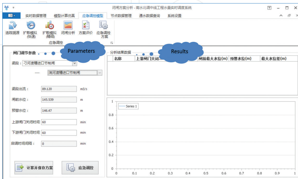
Figure 5. Interface of Emergency operation Plan.

The module function interface is displayed by taking the emergency operation plan setting interface (Figure 5) for example: