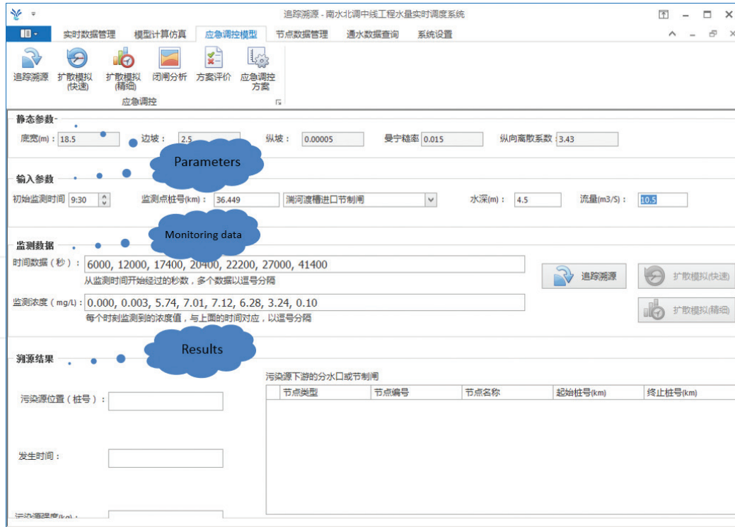
Figure 4. Traceability interface.