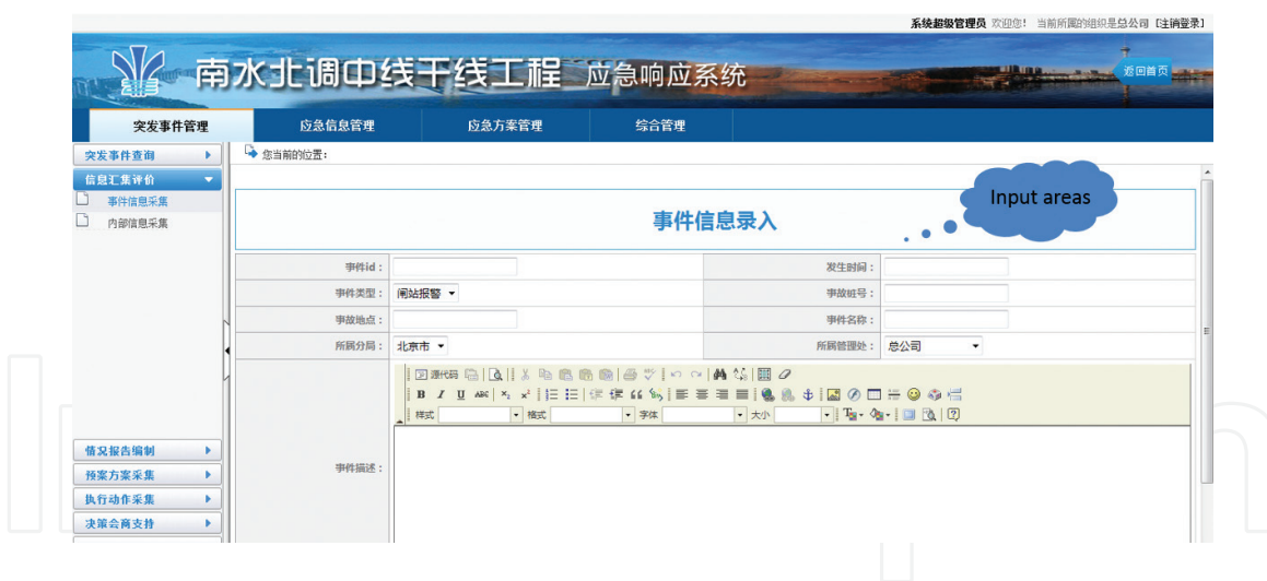
Figure 6. Event information input interface.