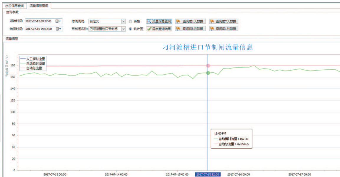
Figure 3. Flow data query interface for check gate in Diaohu River.