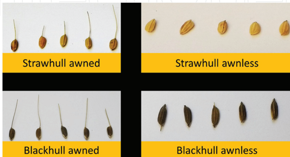
Figure 2. Weedy rice of different hull color and awn length collected from various rice fields of Arkansas, USA, in 2008–2009.

Morphological diversity in weedy rice can be attributed to its high genetic diversity. The genetic diversity of rice has been estimated using various markers like random amplified polymorphic DNA (RAPD), restriction fragment length polymorphism (RFLP), amplified fragment length polymorphism (AFLP), and simple sequence repeats (SSR) [50–54]. Of these SSR markers are most commonly