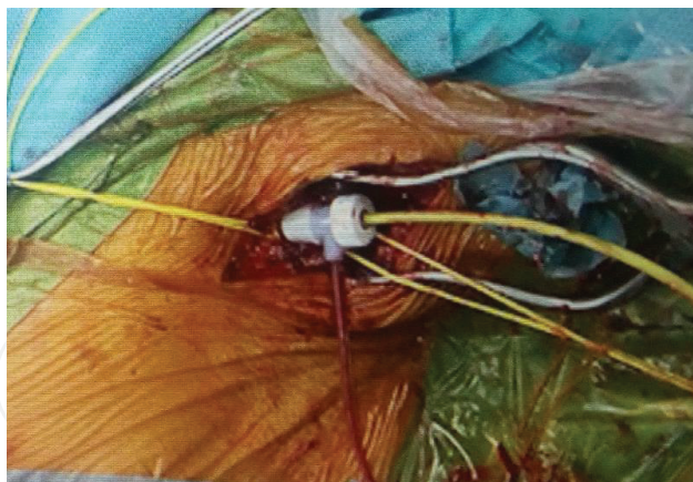
Figure 3. Axillary approach (12 FR introducer sheath-coda LP balloon catheter).

free flow. In this case a partial salvage of the graft can be performed anastomosing the surgical graft with the proximal part of endograft, between two polymer rings or above the first.