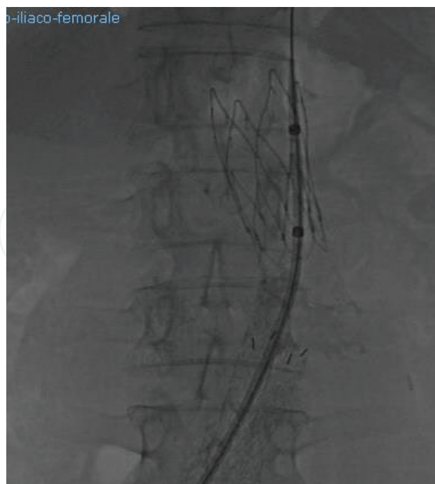
Figure 2. Aortic occlusion balloon (coda 32 mm) at level of Freeflow of ovation 26 mm through femoral approach by means of 12 Fr dry seal sheath.

is speculative and hazardous. We prefer to perform a cut below the anchoring barbs, leaving the free flow in place. A Dacron graft is sutured in an end-to-end fashion, passing the stitches through the aorta and the first covered stent in order to minimize the risk of late complications. In case of necessary total endograft excision (infection), a thoracoabdominal approach must be planned. Some new generation endoprosthesis, as Ovation prime, have a very long