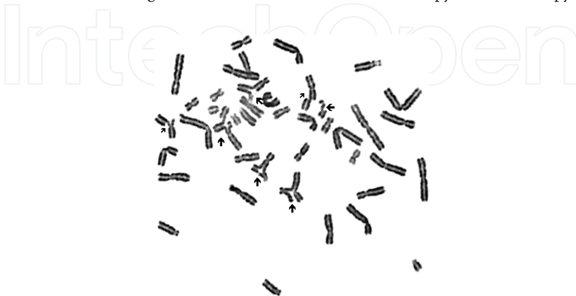
Figure 3. Chromosomal/chromatid breaks as indicated by arrows induced by MMC from patient with FA.

Chromosome fragility test method can differentiate between FA and non-FA cell usually but there are some limitations of this method: (1) it cannot detect the carriers, (2) it is often inconclusive in somatic mosaic cases of FA and (3) false positive results from this test can be seen under the condition that tested individual referred for excluding of FA is under treatment with radiotherapy or chemotherapy