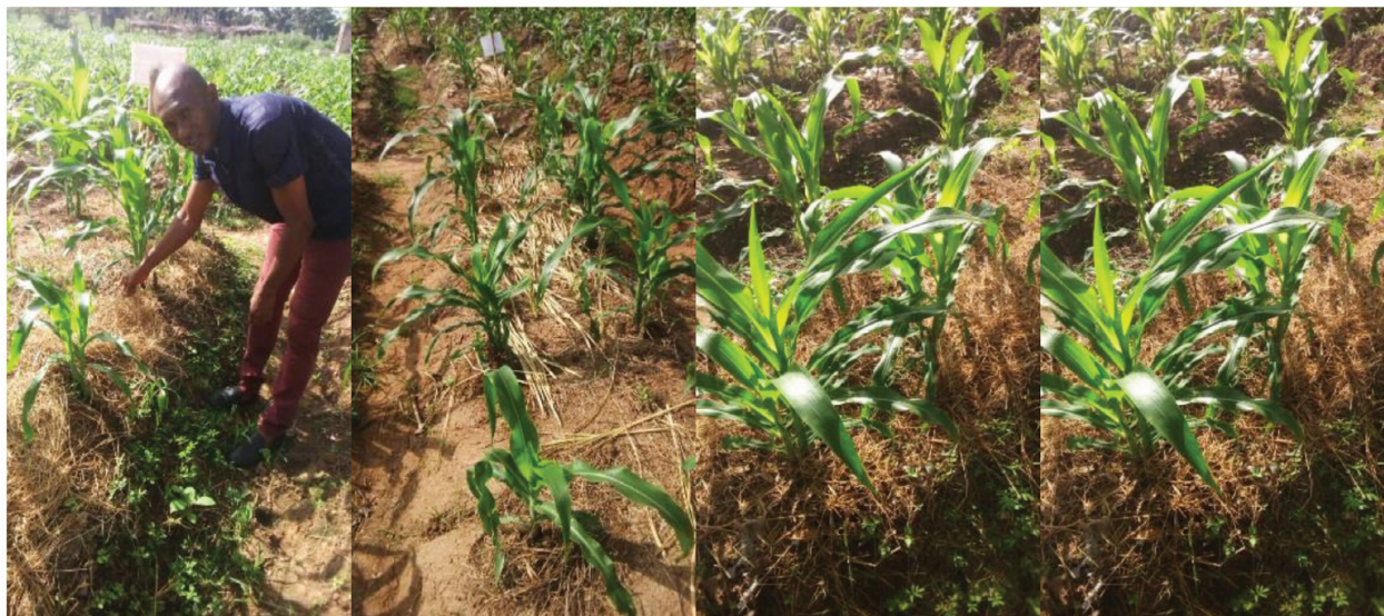
Figure 4. Cross section of mulched maize farms available in the study area.

aeration and moisture holding capacity of the soil. Types of grasses usually used for mulching purposes in the study area include: spear grass ( Heteropogon contortus ), and guinea grass ( Panicum maximum ). [57] observed that growing of varieties of crops on the same plot of land is an appropriate adaptation strategy for farmers because it helps to avoid complete crop failure as different crops may be affected differently by climate variability and may also require different soil nutrients.