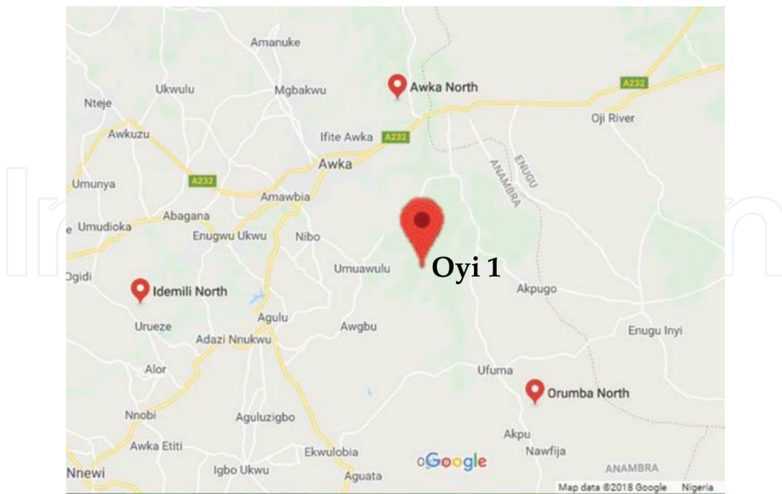
Figure 3. Map of Anambra state showing the four sampled study sites of Akwa North, Idemili, Orumba North and Oyi 1 local government areas (L.G.A.).