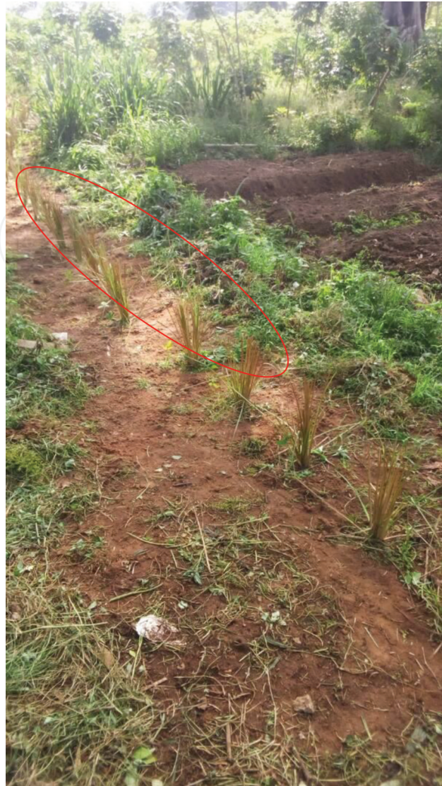
Figure 5. The type of vertiva grass (red circled) that is planted for controlling erosion on farm farms in Anambra State.

Consequently, some smallholder maize farmers plant vetiver grass ( Chrysopogon zizanioides ) in (Figure 5) to control erosion menace on their maize farms.