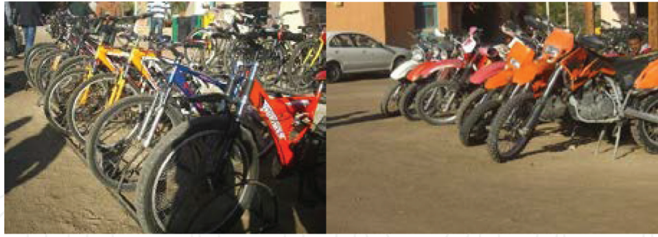
Figure 8. Bike rents and motorcycle.

the entire Nuweiba area is lacking in this particular aspect, as no means of public transport between the different eco-lodges is provided, and public transportation in the area is not quite developed. In the case of El Gouna, although it is considered a residential and touristic area, the main transportation there are bicycles, tuk-tuk and buses in addition to private cars. It is considered a walkable area; however in summer, it becomes so hard to walk or cycle during the day. The central area of El Gouna is just a pedestrian area and just a touristic place without even any economical place. Walking and biking are the main mobility means, and in El Gouna they used shared bus service to reduce car dependency. According to [32], there are several transport services that were launched in 2014 that combined a petrol engine with an electric motor for cars and shuttles. These allowed the ability for cars to run on electricity alone, all around El Gouna, and so reducing the carbon emissions ( Figure 8 ).