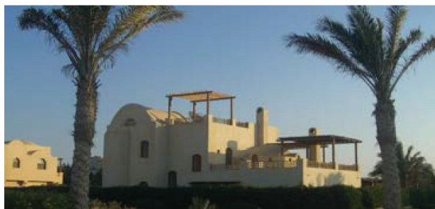
Figure 5. Example for using wind catches as passive cooling strategy in EL Gouna.

In Basata, several passive strategies were applied for energy-efficient cooling, heating, ventilation and natural daylight. The optimal use of natural wind patterns and night flush effect together with encouraging cross ventilation reduced the need for air-conditioning or any other forms of artificial cooling in summer especially inside the reeds and bamboo huts. While in the adobe/stone chalets, the high thermal mass of the walls and high-domed ceilings played a major role in reducing heat gains during summer and providing adequate indoor thermal comfort all year round. In winter, for example, the warm night sea breeze and thermal mass of the chalets stone walls help in providing warm indoor comfort with minimal need to night heating. In Habiba, the applications for passive systems were limited, but there were few trials in using passive heating systems like Trombe walls, and for cooling they depend mainly on cross ventilation strategies using windows and doors crossing each other. In El Gouna, they mainly depend on high thermal mass walls. In addition to some roof structures that are dome or vault shaped with high ceilings, which help in reducing cooling demands during the long summer season. Wind catchers and solar chimneys were used in some of the buildings for cooling and ventilation. The same for using passive cross ventilation which is crucial in the three projects because of the hot humid weather ( Figure 5 ).