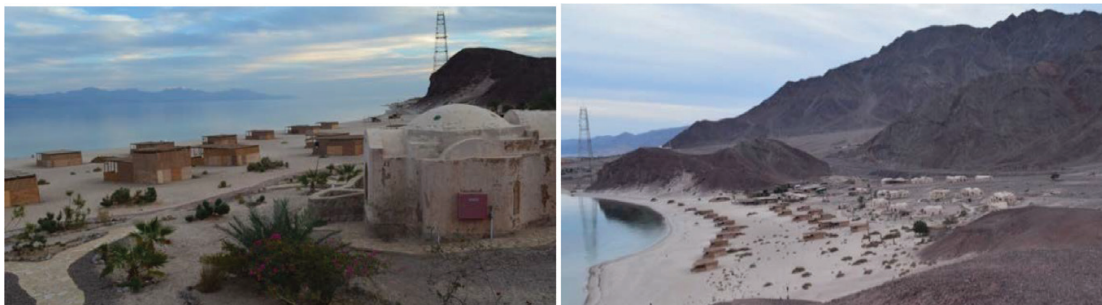
Figure 3. The urban layout and the arrangements of huts and chalets in Basata showing the footprint and low density.

As for El Gouna, it is a small community spreads over 10 million m 2 of unspoiled terrain with 10 km of pristine beachfront located on the coast of the Red Sea, 25 km north of Hurghada. It contains residential area such as hotels, resorts and housing area together with public buildings such as universities, schools and libraries and finally the commercial and services area. On the other hand, El Gouna is to a great extent a gated community, with guarded entry gates surrounding the community. It is divided up to several parts; the island of El Kafr, the downtown area, the Marina area, and the workers' residential quarters. El Kafr mostly holds residential units. The downtown area is the main commercial zone, devised of several shops, restaurants, low profile residential areas. The Marina area holds two artificial bays with a waterfront walkway that has several small buildings ( Figures 3 and 4 ).