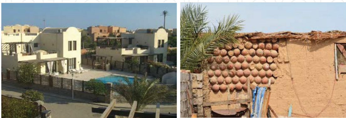
Figure 4. To the left sample of architecture style at EL Gouna and the right for the trials in using natural materials in Habiba.