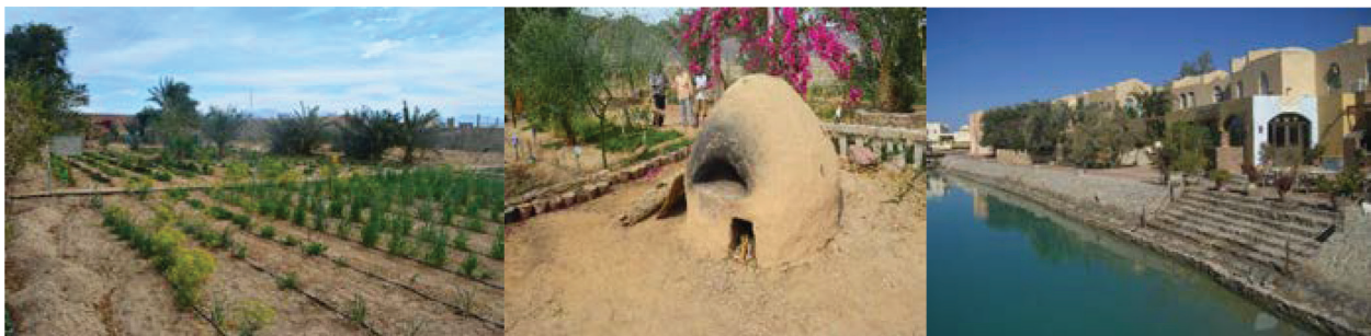
Figure 7. Urban farm in Habiba farm, and the urban spaces at EL Gouna.

The main idea is to have Basata as a car-free community. The car parking spaces are only on the entrances of the project and not allowed further on. The car parking share is almost 0.3 for each dwelling. Walking and biking are the main mobility means. In Habiba, mobility and urban transport has not really been developed sustainably in the Habiba community. Reliance is mainly on transportation by car and automobiles to get to the area. Inside the eco-lodge area, walking is the main mode of transportation as the area is not very big and so there is no need for any other means. However, the farms and learning centre are a bit far from the eco-lodge, and transportation to them requires an automobile. It should be noted that