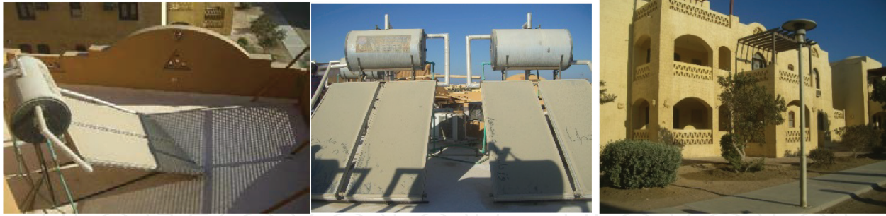
Figure 6. Using solar water heater and PV systems for electricity production in EL Gouna.

footprint with a minimal level of urban density. It is easy to cycle or walk and move around the place even when there is no specific cycling or walking lanes. One of the main environmental site concerns was but is not limited to preserving the abundant marine life, fauna and flora. There is no artificial planting or importing non-endemic flora. Grass is not used as ground cover because it requires huge amounts of freshwater and polluting fertilisers.