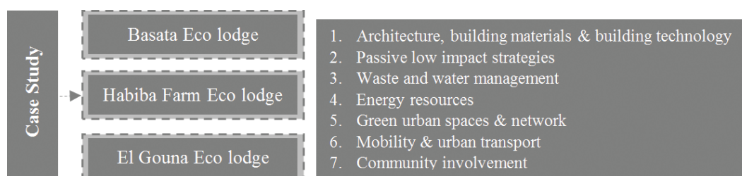
Figure 2. The three case studies analyzed in this study.

Habiba is an agricultural-based community farm located in Nuweiba as well. The community is composed of a beach eco-lodge, an organic community farm and a learning centre that