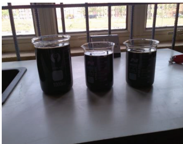
Figure 1. Samples of waste frying oil.