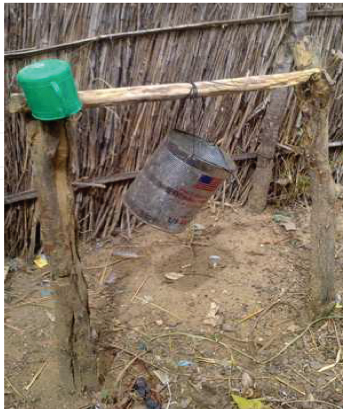
Figure 2. Hand washing facility at a toilet in rural Malawi.

Most of the hygiene initiatives are implemented by nongovernmental organizations (NGOs) and rarely by the government. Despite advocating for water sanitation and hygiene (WASH), there is not enough initiatives introduced by the government through relevant ministries (i.e., Ministry of Health and Ministry of Agriculture, Irrigation and Water Development in Malawi), to enhance hygiene