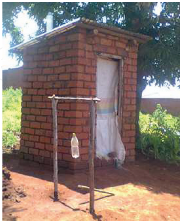
Figure 1. Tippy tap close to toilet for hand washing in rural areas of Malawi.