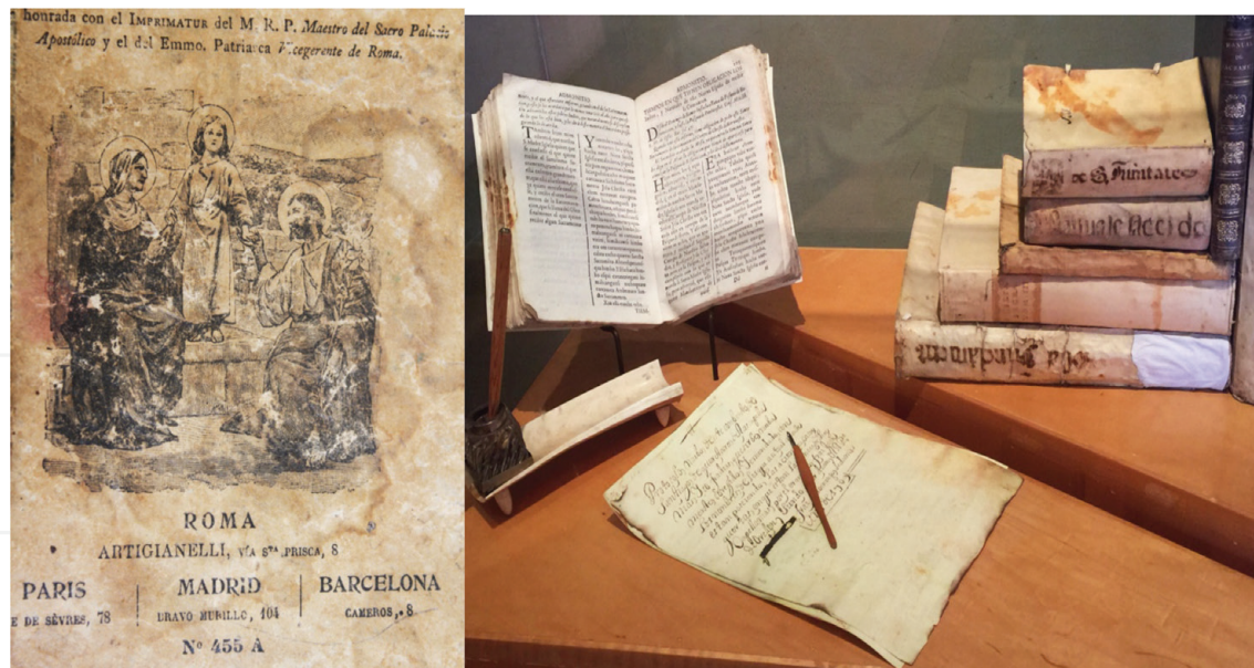
Figure 2. Paper biodeterioration..