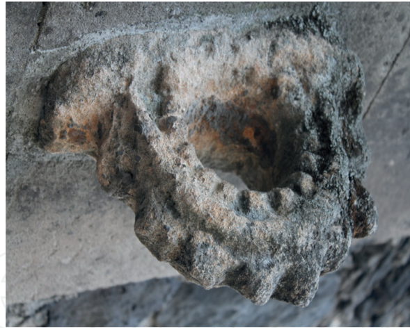
Figure 1. Biodeterioration on stone (photo: Laura Castellón).

Cyanobacteria and algae such as chlorophytes, chrysophytes, and diatoms are a morphologically diverse and widely distributed group endowed with remarkable adaptability to variable environmental conditions and effective protection mechanisms against various abiotic stresses that enable them to colonize almost all classes of extreme lithic habitats [24]. These microorganisms form pigmented scabs (patinas) and incrustations that affect the substrate esthetically and cause physical and chemical deterioration of the rock. The epilithic cyanobacteria play an important role in the dissolution of the limestone carbonate, being able to cause the detachment of parts of it, due to a decrease in the coherence of the crystals around the colonies [25, 26].