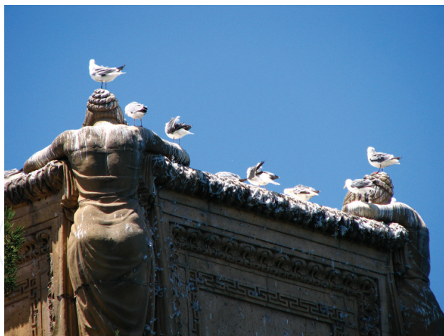
Figure 1. Gulls excrements blemish and destroy buildings and monuments [1].