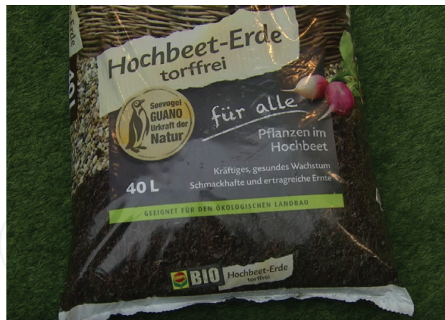
Figure 8. The Guano logo provides commodities with a glorious nimbus [42, 43].

The project “Proabonos” promotes ecologically compatible Guano mining and targeted Guano marketing at preferential prices to small farmers and indigenous peasant communities. These measures should contribute to a sustainable increase in agricultural yields as a contribution to overcoming poverty, taking into account ecological considerations. From 1986 to 2007, the state-owned Proabonos fertilizer Company harvested 342,637 t of Guano. Almost the same amount was harvested in Peru in 1861 within a year [29].