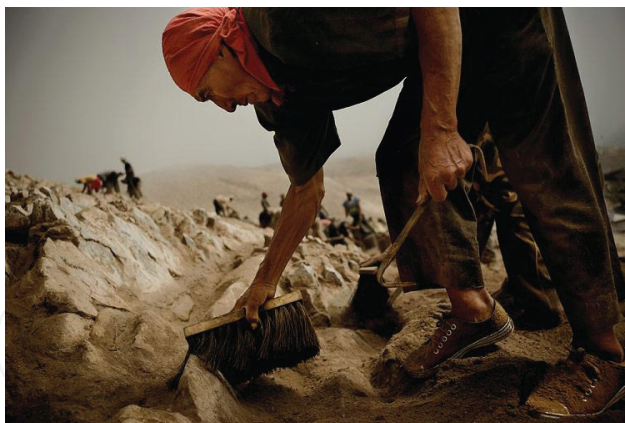
Figure 9. Guano extraction on the Peruvian island Guañape Norte.

The Guano extraction always takes place after the same dismantling steps. First, the raw Guano is swept out of the rock crevices or scraped together ( Figure 9 ). Hard-baked Guano is loosened with pickaxes.