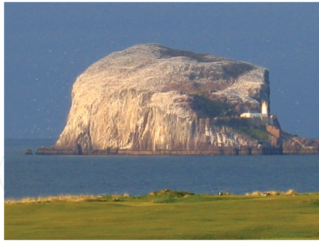
Figure 3. Like the island “Crab Key” in Ian Flemmings famous novel “Dr. No” Bass Rock in the Firth of Forth (56.0769°N 2.6410°W) is covered with white Guano produced by 150,000 gannets plus guillemots, razorbills, cormorants, puffins, eider ducks and numerous gulls.

so-called “bat Guanos”, which are occasionally found in large caves, especially in Asia and the Caribbean and used locally or are rarely traded as fertilizer. In this chapter the term “Guano” always refers to Guano deriving from seabirds. The writer Victor von Scheffel (1854) once wrote a hymn giving a poetic description on the genesis of Guano [7].