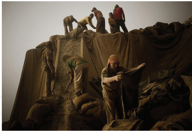
Figure 11. Sieving of the raw Guano.