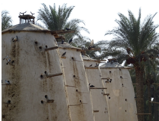
Figure 2. Pigeon houses at SEKEM farm in Belbeis near Cairo deliver birds dung as essential fertilizer for small scale farming.

balance of non-agrarian ecosystems [3] and an essential source of plant nutrients in many smallholder farming systems in developing countries, like for instance Egypt [4] ( Figure 2 ).