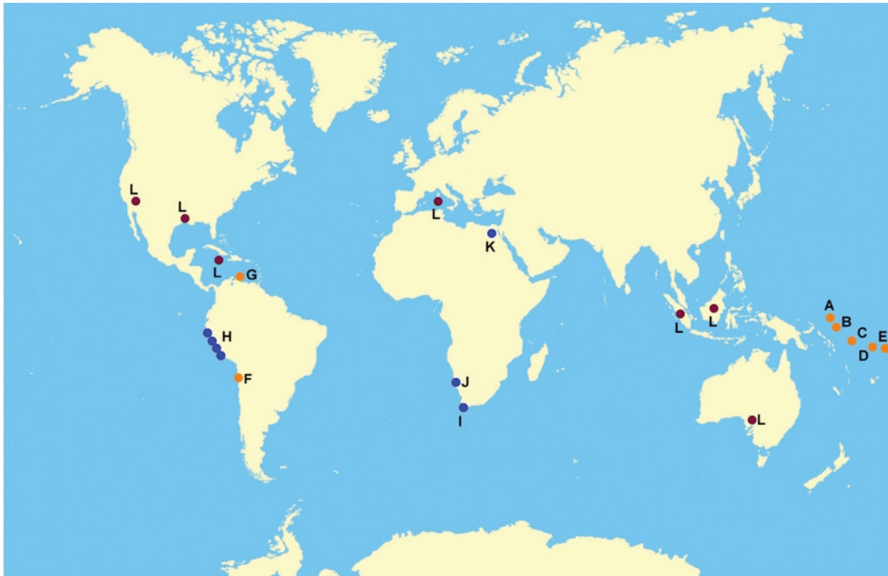
Figure 5. Important deposits of phosphate Guanos (A-G), nitrogen Guanos (H-K) and bat Guanos (L).

conditions for the growth of coral reefs are given, which represent the calcareous substrate for the formation of phosphate Guanos.