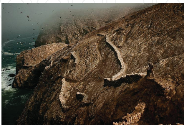
Figure 10. Century-old isohypses-parallel stone walls for protection against ragging of the raw Guano.

The overburden remaining on the gratings is dumped into the sea. The powdered sieved end product is shoveled into white plastic bags of 50 kg capacity printed with Probonas emblem. Since no heavy equipment can be used for transport on the Guanofelsen to protect the environment, the entire transport of the bags is also carried out by physical force. For loading, the sacks are usually transported to the edge of the cliffs and then transferred to ships with a simple cable pull ( Figure 12 ).