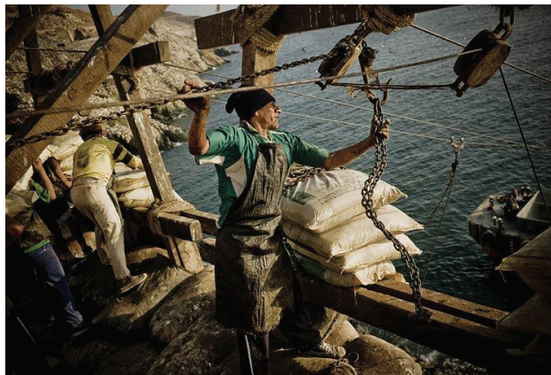
Figure 12. Loading the final product.

Each worker shouldered 125 sacks per day – this corresponds to a total weight of 6.25 t. In order to be able to sustain this extremely strenuous work in the long run, the different working positions are occupied in rotation. Due to extreme climatic conditions, working hours usually start at 4 am and end at 12 noon to avoid high temperatures in the afternoon of more than 35°C. The usual working rhythm is 3 months without rest days.