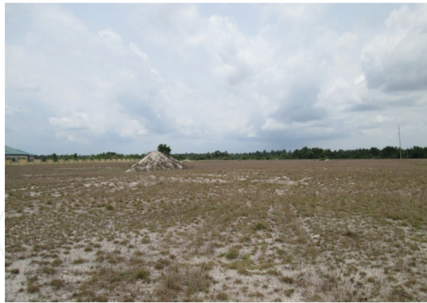
Figure 2. Dredged and sand filled mangrove forest in Buguma, Niger Delta, Nigeria. There are still some mangroves that can be seen at the foreground. On the left of the picture is the fence of a secondary school. No mangrove tree has ever grown in this area since the sand filling in 1984. The area is now occupied by weeds and other alien plant species.

are a variety of non-mangrove species in both the seaward and landward areas. The landward area has sandy soil that has large percentage growth of grass species such as corn vine ( Dalbergia ecastaphyllum ), coco plum ( Chrysobalanus icaco ) etc. Because of the proliferation of anthropogenic activities around mangrove forest some grass species had taken over the area. Examples of other species present include carpet grass ( Axonopus compressus ), elephant grass ( Pennisetum purpureum ), guinea grass ( Panicum maximum ), goose grass ( Eleusine indica ) and goat weed ( Ageratum conyzoides ). A major observation during field work is that mangroves when cut never grow back rather the area from where they are cut is over taken by weeds [28] which forms gradients around the wetland soil. Oil and gas exploration also affect species composition in mangrove forests [35]. For example, industrial activities had led to a permanent change in soil and species composition, which accelerates the proliferation of weeds and other alien species. The weed when they grow becomes the hiding place for foreign insects and rodent pest, which later invade the mangroves.