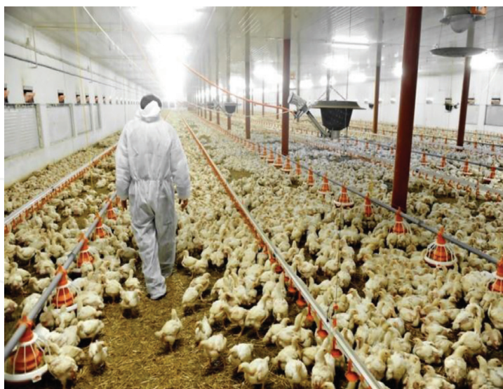
Figure 6. Resveratrol administered as a feed additive to control aflatoxicosis in broilers [92].

Xu et al. [94] observed that resveratrol ( 3.85 \mu\text{g mL}^{-1} ) supplementation decreased duck enteritis virus multiplication by 50%. This may be due to the inhibition of viral proliferation in the host cell.