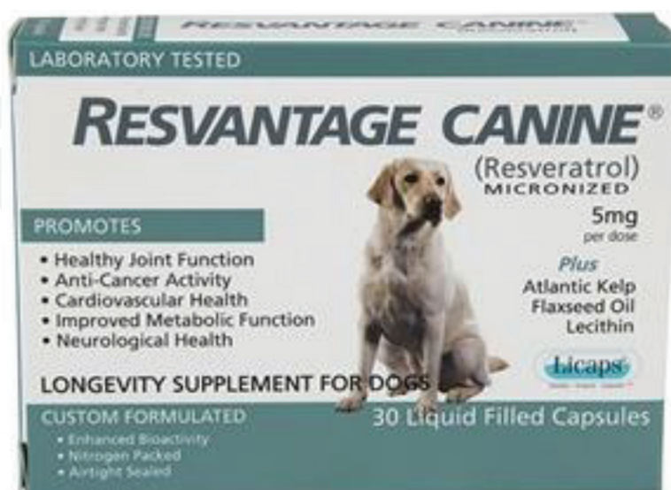
Figure 4. Resvantage Canine®: a resveratrol supplement used to improve health needs of dogs.

The meat of cows that drank a liter of homemade local wine was found to have a wonderful texture and impressive aroma and flavor. Researchers at Thompson Rivers University in British Columbia are studying the effects of wine on cows. The study is to demonstrate the