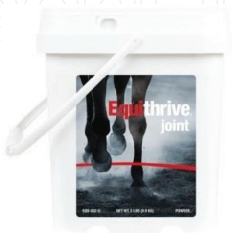
Figure 3. Equithrive ® : a horse supplement, containing resveratrol and hyaluronic acid [81].

Studies by Ememe et al. [82], showed a significant reduction in values of creatine kinase and glucose in the horses administered resveratrol and hyaluronic acid (equithrive joint ® ) (Figure 3) supplement. Elevated levels of these substances have been associated with a reduction in metabolic efficiency in aging animals. Hence, administration of equithrive joint ® may help to reduce the harmful effects of these biochemical parameters during aging in horses. Also a study on horses exhibiting hind-limb lameness and poor performance was carried out with equithrive joint ® . The researchers injected each horse's lower jock joints with triamcortolone before supplementing with equithrive joint ® for 4 months [83]. The result showed higher percentage of riders who reported better performance of their horses. Ememe et al. [84] also reported that administration of equithrive joint to aged and lame horses decreased the serum MDA concentration and modulated the serum content of GPx, catalase, and SOD. The results suggested a potential protective effect of equithrive joint against oxidative stress and aging in