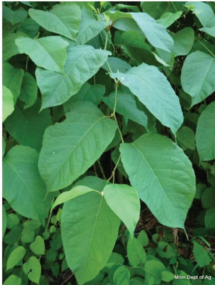
Figure 2. Japanese knotweed, a well-known rich source for resveratrol [8].

Khan et al. [19] and Sahin et al. [20], stated that resveratrol increases regulation of antioxidant enzyme like catalase (CAT), superoxide dismutase (SOD) and glutathione peroxidase (GSH-Px). This result in reduction of oxidative stress and attenuation of inflammation, and these mechanisms may account for many of its health benefits. The antioxidant activity of resveratrol may also inhibit oxidation of low-density lipoproteins (LDL), and therefore, decrease endothelial damage associated with cardiovascular disease [21, 22].