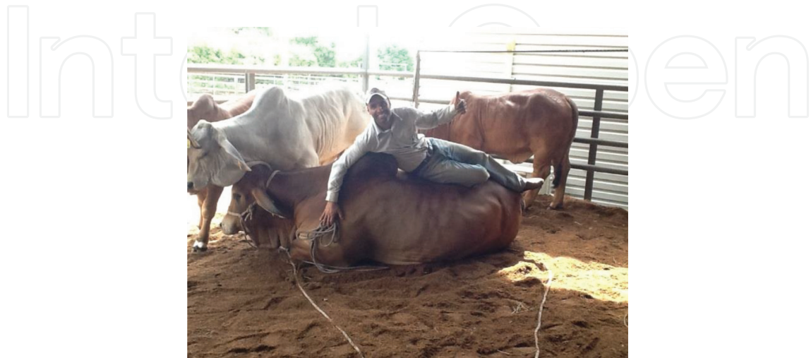
Figure 5. Confidence established.