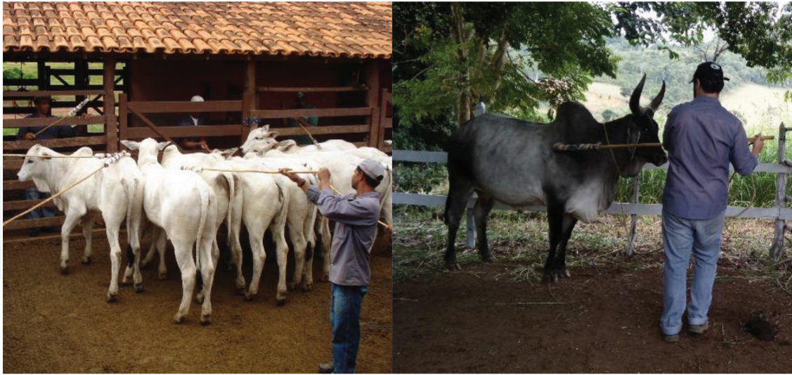
Figure 3. Reduction of flight zone and gradual approach during the process of natural taming using ropes and swabs.