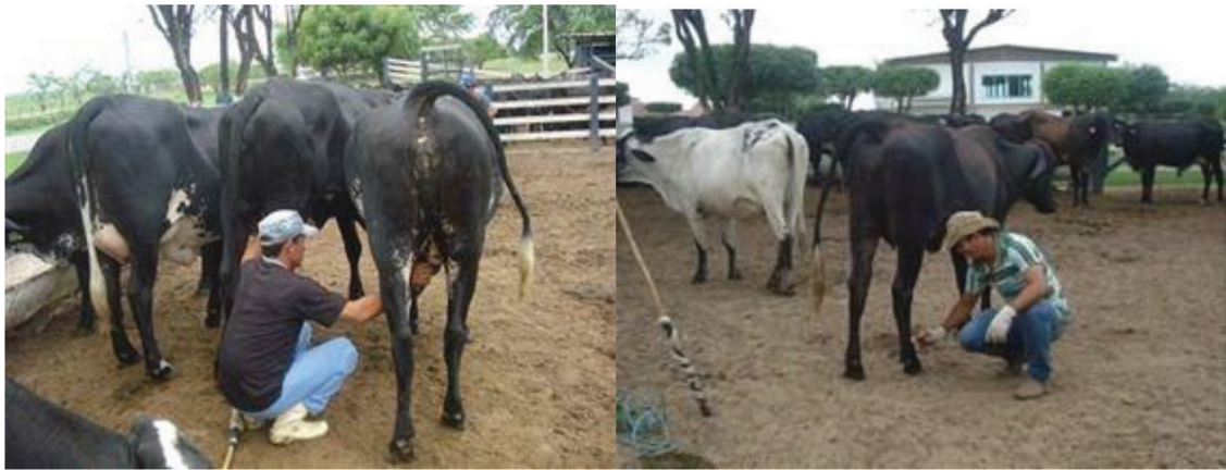
Figure 4. Desensitization of the udder and hind limbs.