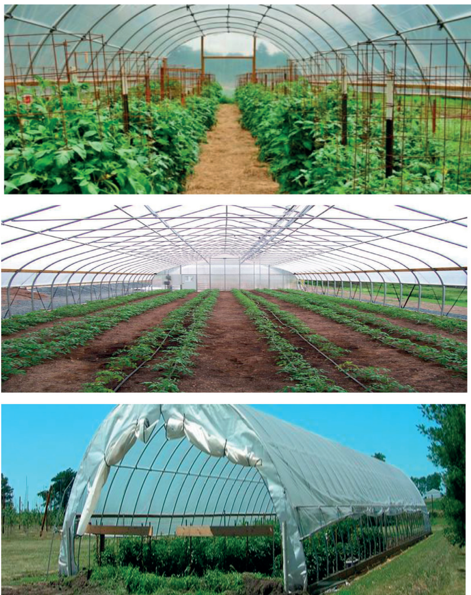
Figure 1. Interior and exterior features of high tunnels for controlled vegetable cultivation.

system which supplies water at low tension and high frequency to create optimum environment for growth of the vegetable [41, 42]. By avoiding soil medium, the use of hydroponics enables the grower to prevent diseases and soil-borne pests, such as nematodes, that are difficult to control [43]. Tomato production under protected systems such as hydroponics allows cultivation in regions inappropriate for conventional agriculture by efficiently using natural resources particularly water and soil [44]. Hydroponic systems provide regulation of harvesting, avoiding crop rotation, better fruit quality, better crop handling, and better control over nutritional needs and environmental conditions. Growing tomatoes under hydroponic system allows the grower to raise them under a controlled environment with less chance of disease, faster growth, and greater fruit yield. This offers several advantages in terms of the quantity and quality of products obtained per unit land area over cultivation in soil [45].