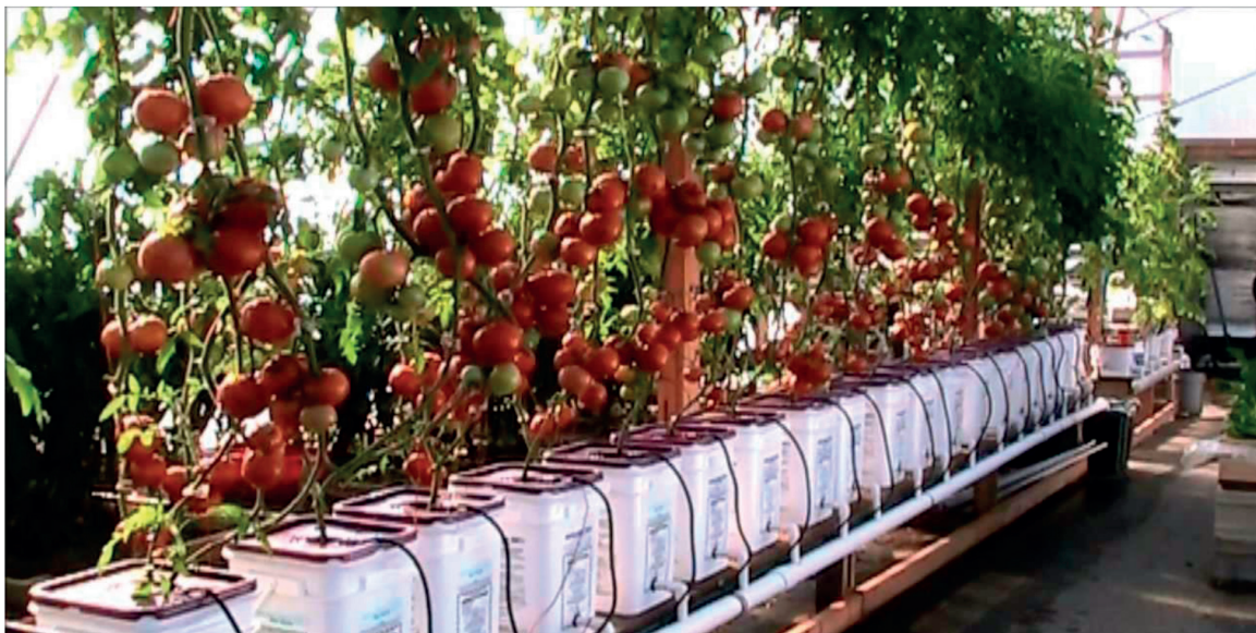
Figure 2. Dutch bucket hydroponic system for cultivating tomatoes ( https://www.google.com.gh/search?tbm = isch&sa = 1&q = hydroponics+tomatoes&oq = hydroponics+tomatoes&gs_l = psy-ab.3..0j0i5i30k1j0i24k116.202616.205468.0.206233.9.9.0.0.0.384.1735.2-5j1.6.0....0...1.1.64.Psy-ab..3.6.1732...0i67k1.0.HQe-PNKGi6I#imgrc = gjqgs0WVVSaQvuM ).