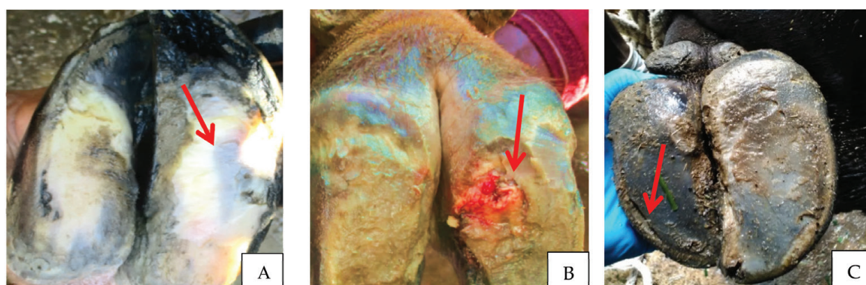
Figure 2. (A) Severe sole hemorrhage (red arrow) and toe necrosis (B) sole ulcer (red arrow lateral claw) (C) white line fissure (red arrow medial claw).

About 90% of lameness disorders in dairy cows are attributed to claw lesions [12]. Claw lesions have been broadly categorized into infectious and non-infectious causes [13]. Non-infectious causes also described as claw horn disruptive lesions (CHDLs), are pathological alterations arising from the internal capsule or claw horn tissues. Sole ulcers (SU), sole hemorrhages (SH) and white line disease (WLD) are the major lesions in this category ( Figure 2 ). These conditions are multifactorial, as supporting evidence suggest the interplay between rumen acidosis laminitis complex, prepartum metabolic, and hormonal changes affecting the stability of the pedal bone and suspensory apparatus [14, 15], as well as biomechanical reaction at the claw-floor interface [16]. In addition, animal-based measures such as body condition loss, reduced thickness of the digital cushion (DC) [17], injured hock, and overgrown claw have been associated with increased odds of CHDLs [18, 19].