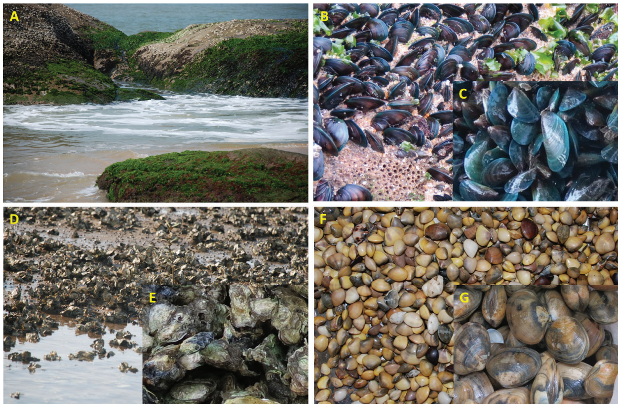
Figure 1. Common marine bivalves and their habitats from the Indian coast. (A) Intertidal rocky area showing green mussel beds from the south west coast of India; (B) green mussel Perna viridis ; (C) enlarged view of green mussels; (D) oyster bed consisting of Crassostrea madrasensis and Saccostrea cucullata exposed during low tide; and (E) enlarged view of C. madrasensis and S. cucullata ; (F) clam bed consisting of Meretrix casta and (G) enlarged view of the clam Paphia malabarica .

range of contaminants and may thrive even in highly polluted environments [3, 14]. These qualities make them a group of candidate species for biomonitoring programs across the globe. As filter feeders, they bioaccumulate various contaminants and their tissue concentrations provide a time-integrated picture of contaminants in the environment [15, 16]. It has been reported that bivalves accumulate trace metals in their tissues at levels up to 100–100,000 times higher than the concentrations observed in the seawater in which they live [5, 17]. Therefore, several chemical contaminants, including trace metals, present at undetectable levels in seawater can be detected in bivalve tissues. Different species of clams, mussels, and oysters have widespread distribution across the continents ( Figure 1 ), and many of those species have been successfully used for monitoring the concentrations of contaminants in the marine environment [5].