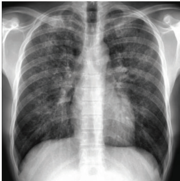
Figure 1. Chest radiography in a patient with absolute neutrophil count <0.1 \times 10^9/L : “Masked” pneumonia.

However, besides these “loud” clinical manifestations, clinicians must keep in mind that the signs of these infections may be sometimes crude and atypical because of the neutropenia ( Figure 1 ). For practitioners, it is to note that pneumonia is often asymptomatic because of the lack of neutrophil cells. In this situation, thoracic CT-scan may be proposed with much better results than X-ray ( Figure 2 ). Similarly, when antibiotics are administered prophylactically, or at the beginning of this adverse event, both the patient’s complaints and the physical findings may be “masked,” and fever is often the only clinical sign detected [2].