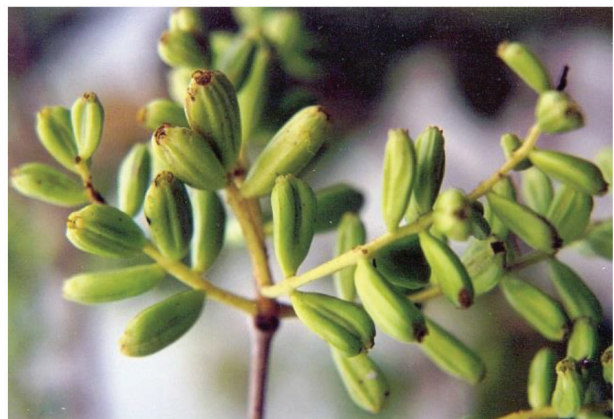
Flowers and propagules of Laguncularia racemosa.