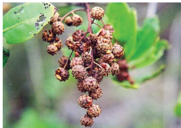
Flowers and fruits of Conocarpus erectus.