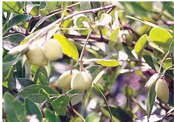
Flowers and propagules of Avicennia germinans.