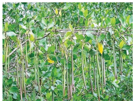
Flowers and propagules of Rhizophora harrisonii.