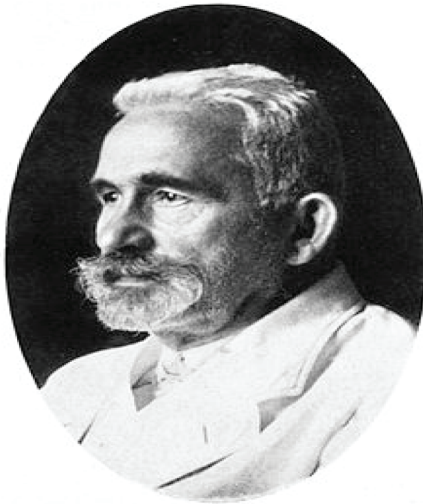
Figure 3. Emil Kraepelin in his later years. Born in 1856 and died in 1926 (aged 70).

all mental impairment in elderly peoples. Currently, it is well known that vascular dementia and AD can be associated.