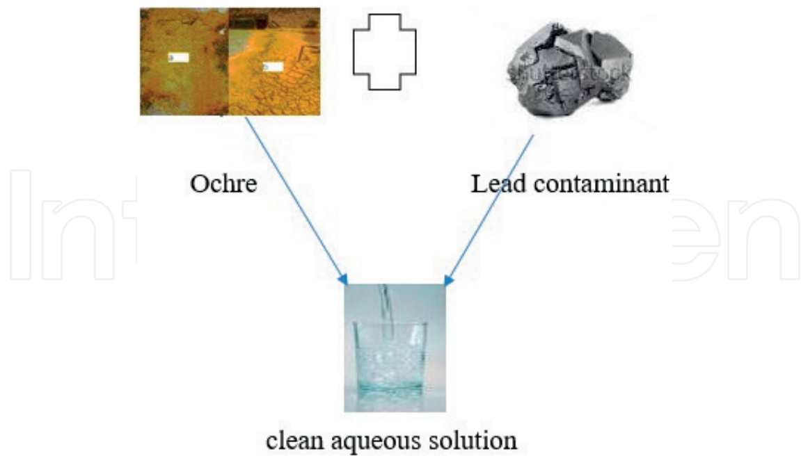
Figure 3. Graphical summary for lead interaction with ochre.

The influences of various factors, including reaction time, solution ionic strength, adsorbent size, initial pH and solid quantity on the adsorption quantity, were studied. Adsorption of heavy metals of copper and zinc was looked at by means of single minerals of ochre and oxides of iron and their mixed mineral components with clays in sulfidic-anoxic state. Attempt was completed to lower the quantity of metal levels in these mine pits before release into the ecosystem [47].