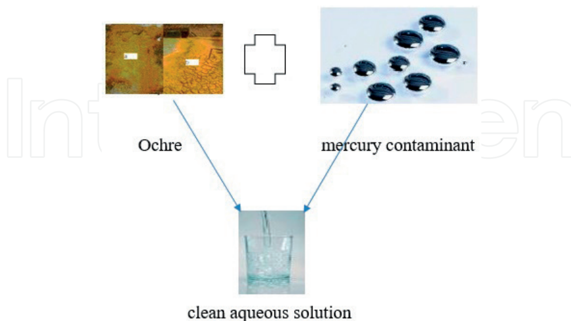
Figure 2. Graphical summary for mercury interaction with ochre.

Again, heavy metal reduction is controlled by chemistry and makeup of the aqueous solution, solution pH, ionic strength and adsorbent concentration, besides the reaction time of the solid stage in the wastewater. However, the adsorbent particle size of such usual adsorption methodology could alter the adsorption features involved in the report. Reactions comprising the breakage of bonds in a water molecular form are a function of solution pH and solution ionic strength. Lowering of metal reduction in solution as solution ionic strength increases provides adsorbent water molecular attachment. The opposite describes direct attachment of adsorbate to the external layer of the adsorbent [45]. The quantity of solute-solvent ratio (i.e. solid concentration) consequence is a usual metal removal mechanism, whereby metal reduction in solution isotherm attenuates as quantity of solute-solvent ratio increases. Diverse reaction sites could be formed as contact between the adsorbate and ochre and oxides of iron mineral systems was increased. This study aimed at discovering the outcome of interacting ochre and oxides of iron mineral systems and the mixture components with clays on adsorption behaviour of heavy metals of copper and zinc in relation to chemical composition of solution and reaction time [46].