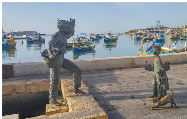
Figure 2. Photo of bronze sculpture at Marsaxlokk fishing village (Malta) with artisanal fishing boats in the background. Promoting the fishing tradition and heritage of this village.

that same sea, which provides for the whole family, generation after generation. This intimate relationship with the sea as provider of goods in the long-term is being lost with the loss of fishing traditions, communities and villages.