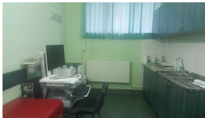
Figure 1. Laboratory for anorectal manometry and biofeedback.

The investigation of the anorectal function in patients with defecation disorders should be carried out in a dedicated room of the laboratory for gastrointestinal motility studies in conditions of