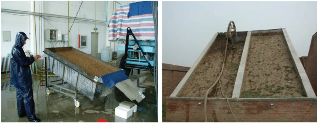
Figure 7. The experimental variant slope soil tank in Beijing Normal University.

The artificial rainfall simulation testing ground is approximately 300 m 2 , concluding 15 trough rainfall simulators, which have various combinations of types of sprayer, water pressure, and rainfall intensity. Every trough rainfall simulator has three swayed sprinklers, spacing at 1.1 m, installed with the height of 5.2 m [9, 10].