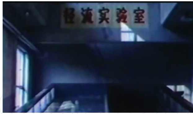
Figure 2. Runoff laboratory of Institute of Geography, Chinese Academy of Sciences.