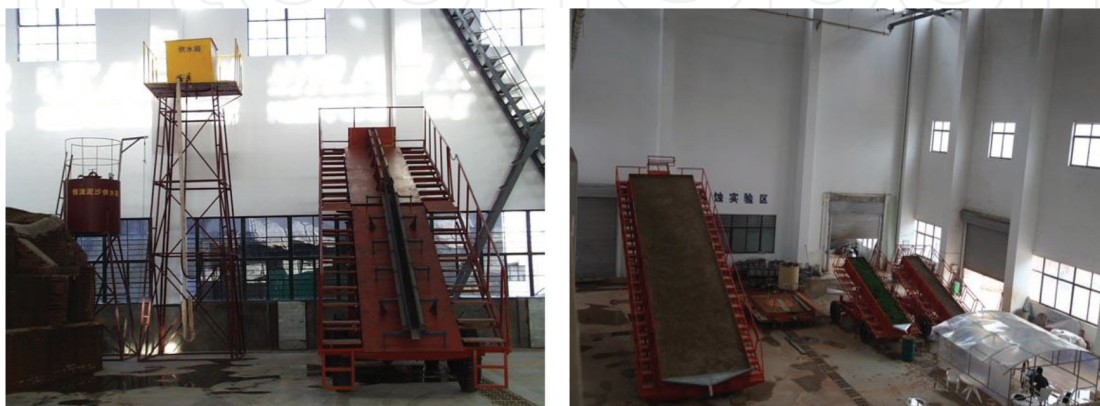
Figure 6. Experimental variant slope soil tank in Institute of Soil and Water Conservation Chinese Academy of Sciences.

The experimental variant slope soil tank in State Key Laboratory of Earth Surface Processes and Resource Ecology of Beijing Normal University is approximately 1 m long \times 0.2 m wide \times 0.05 m deep, using polyvinyl chloride as whole material ( Figure 7 ). The projected area on the horizontal plane of soil plate for every slope is 50 \times 50 cm. On the side of outflow, a V-type collector with more than 2.5 cm of height on other three sides is set up to prevent soil material in the tank spilling out during rainfall procession. Before packing soil into the tank, a good water permeability cloth is paved at the bottom of tank plate to ensure well drainage and evitable soil particle leakage of soil tank in experiment procession. At the bottom of tank, nine leakage drain holes (diameter is 5 mm) are distributed uniformly to make soil water freely permeate. The slope of tank ranges from 0 to 60^\circ .