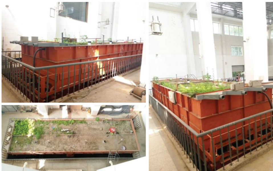
Figure 8. The experimental slope-adjustable soil tank in Hohai university.

The slope-adjustable soil tank is made of welding steel plates splitting into two parts of the main tank and overflow tank in State Key Laboratory of Hydrology-Water Resources and Hydraulic Engineering of Hohai University ( Figure 8 ). The two tanks are connected by four holes at the bottom. Effective volume of main tank measures 12 m long × 3 m wide × 1.5 m deep, while that of overflow tank measures 1.5 m long × 10 m wide × 6.2 m deep. The whole tank is divided into two 1.5-m-wide parts, varying from 0 to 30° under the drive of hydraulic pressure. The decision of its size is optimized profoundly after referencing international