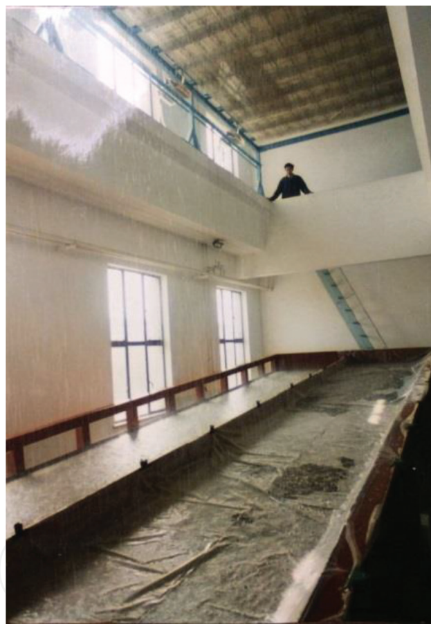
Figure 3. The experimental variant slope soil tank in the runoff laboratory of Institute of Geography.

process. A rainfall simulator system was used to apply rainfall. This rainfall simulator can be set to any selected rainfall intensity ranging from 0.3 to 3.0 mm/min by adjusting the nozzle size and water pressure. The fall height of raindrops was set at 16 m above the ground, which allows all the raindrops to reach terminal velocity prior to impact with the soil surface.