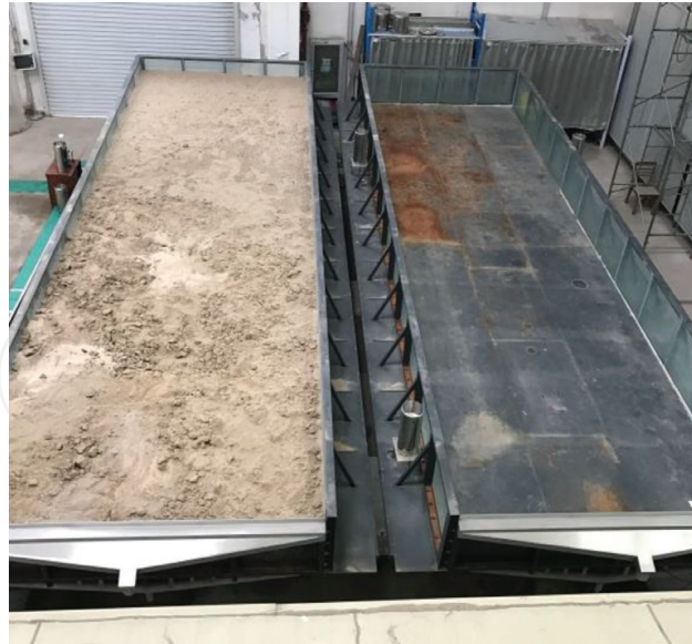
Figure 4. The new experimental sink of runoff and erosion in IGSNRR.

10 m long, 3 m wide, and 0.8 m high, and each one is located under artificial rainfall system. The slope of the experimental sink could be adjusted automatically from 0 to 35°. One 5 cm hole is cut into the downslope end of each plot. A short metal stub pipe is welded onto the hole to form an outlet. Two water flow monitors are horizontally set up in front of each box for the measurement of the runoff. For simulated rainfalls, runoff volume measurements and sediment sample collection are performed every 5 s and 5 min, respectively.