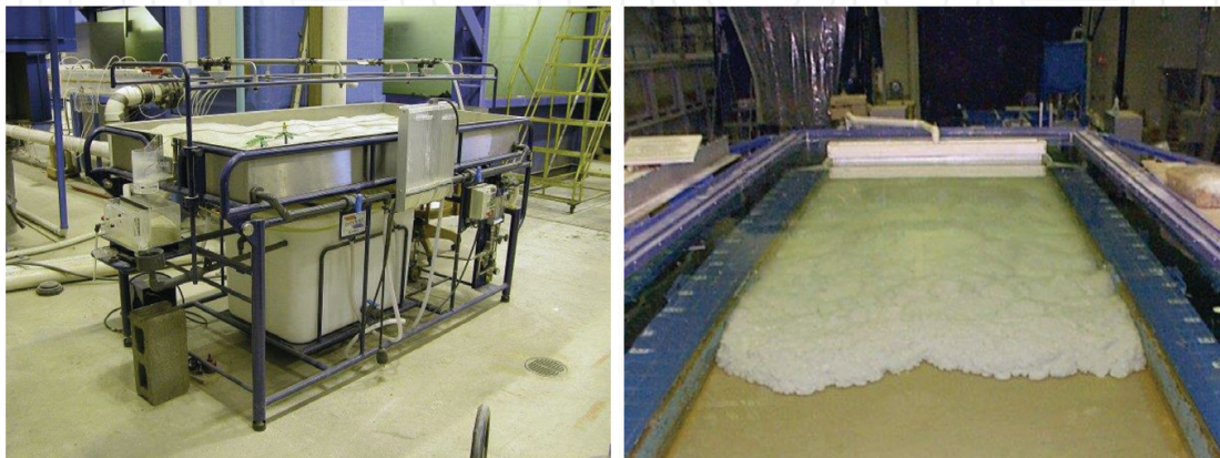
Figure 1. The margins tank of Ven Te chow Hydrosystems lab.

An experimental variant slope soil tank was installed in the runoff laboratory of Institute of Geography Chinese Academy of Sciences in 1965 ([3]; Figures 2 and 3 ). It was the first device in China that was used for study the rainfall-runoff and soil water movement. The tank was 8.0 m long, 3.0 m wide, and 1.0 m deep, with drainage holes at the surface and bottom to facilitate water discharge. The slope gradient ranges from 0 to 30°. A runoff collector was installed at the bottom of the soil tank, which was used for collecting runoff samples during the experimental