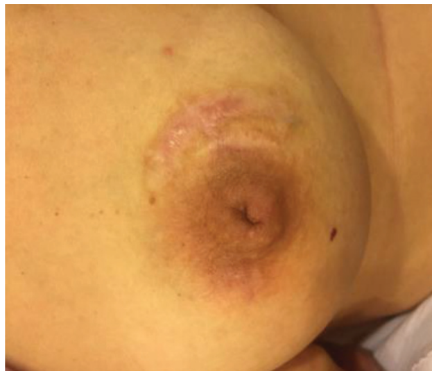
Figure 3. Photograph of the right breast after two months of intense active antitubercular treatment. Patient in recumbent position with healed wound, without sinuses of the areola, and inverted nipple.

14 years; 2 full-term spontaneous deliveries; 1 abortion; pathology: pulmonary tuberculosis (treated and considered healed in 2002); no surgical illness. LMP: August 20, 2008, immunological pregnancy and HIV tests: negative. General physical examination was essentially normal; abdominal examination revealed no mass, no ascites, no hepatosplenomegaly and no other abnormality.