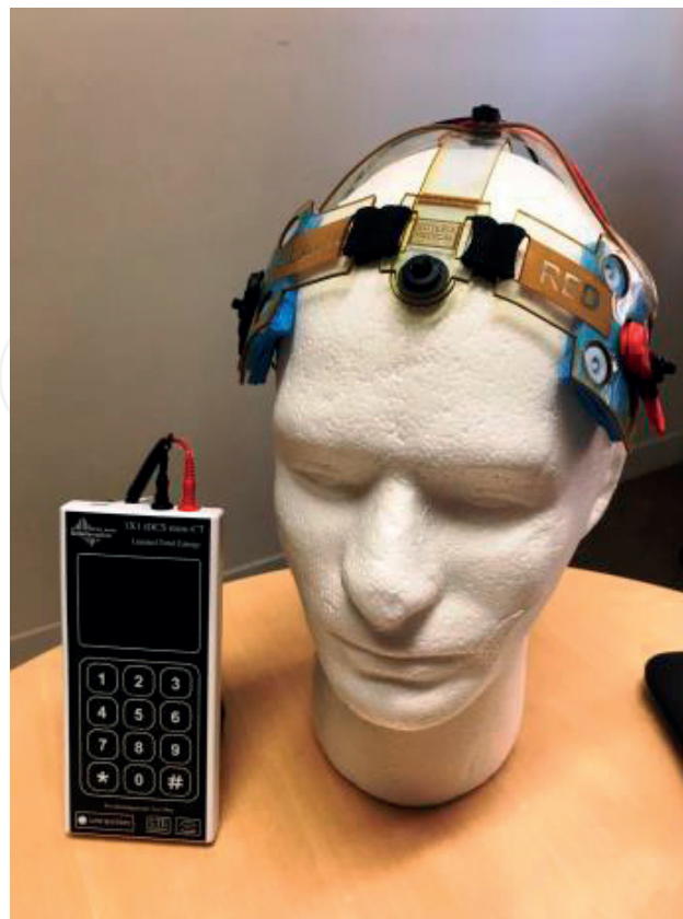
Figure 3. Example of transcranial direct current stimulator (tDCS) setup; mini-clinical trials (mini-CT) Unit, Soterix Medical © .

only a subliminal neural hyperpolarization (under the cathode) or depolarization (under the anode), reducing/increasing in turns the responsiveness of the target neurons to the on-going afferent brain activity. Importantly, when combined with a second input, tDCS could results in powerful induction of LTP or LTD like phenomena. The mechanisms underlying this potential synergistic effect are not fully known, but they may rely on associative plasticity. It is known that task-specific training can induce task-specific neuronal changes based on use-dependent plasticity phenomena [20]. Therefore, the combination of behavioral tasks and tDCS may offer significant chances to achieve neuroplastic changes. The task-dependency of tDCS may influence the inter-individual variability of behavioral or neurophysiologic outcome observed after stimulation [21].