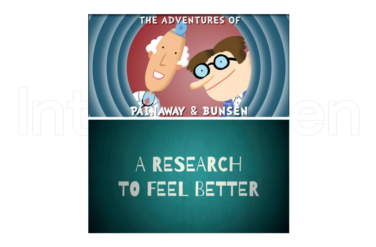
Figure 2. GAPP projects' video: in the framework of the GAPP project activities, two videos have been developed to inform the child participant on the study objectives and procedures according to two age ranges (for children on the top and for teenagers on the bottom).

In the framework of the GAPP project, aimed to confirm the efficacy and safety of gabapentin in pediatric patients affected by chronic pain with a neuropathic component, three booklets and two videos ( Figure 2 ) have been created to inform the child participant on the study objectives and procedures. Two assent forms have been released to obtain his/her consent to