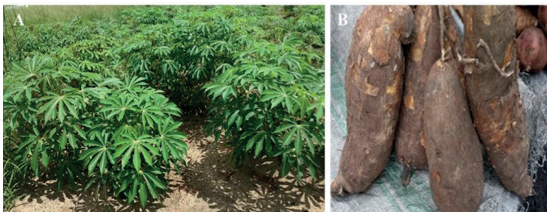
Figure 1. Leaves and roots of cassava ( Manihot esculenta ).

and some minerals and vitamins (vitamin C). The roots are a poor source of lipids and proteins. Manihot leaves contained anthocyanins, flavonoids and other polyphenols. All parts of the plant contained the cyanogenic glycosides (linamarin and lotaustralin) that constitute the antinutrient factors [7, 8].