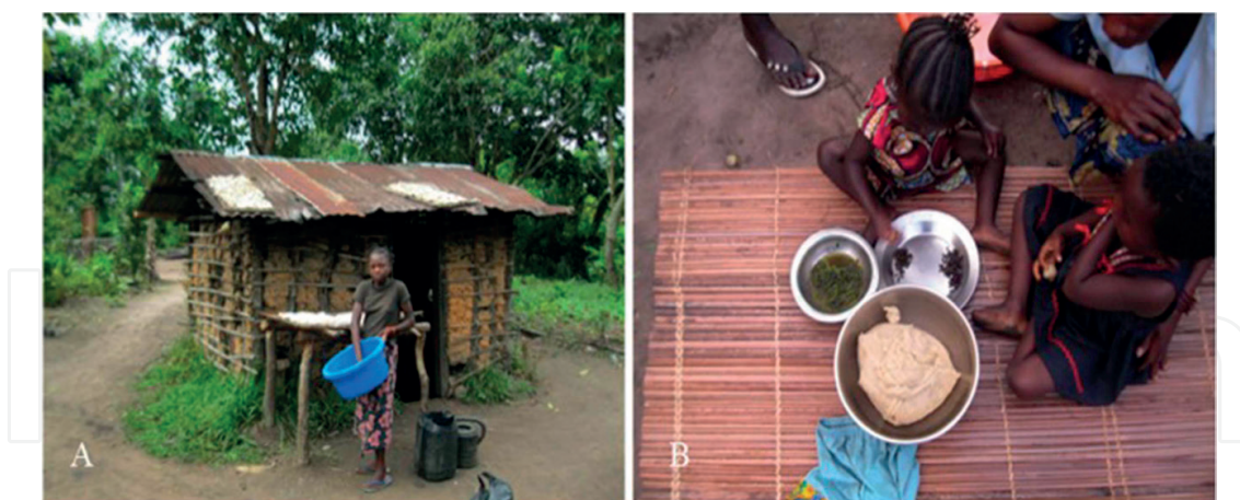
Figure 2. Cassava processing and diet for children of Kahemba. Sun drying of cassava roots soaked in a container by a konzo household of Kahemba city (A) and the structure of a meal for households characterized by a high quantity of fufu accompanied by few vegetables and insects (B).

Few households consumed tea, coffee or herbal teas. Other households consumed boiled sweet cassava roots accompanied by peanuts, voandzous ( Vigna subterranea ) and avocado fruits. Konzo households mostly had one meal per day, consumed preferably in the evenings.