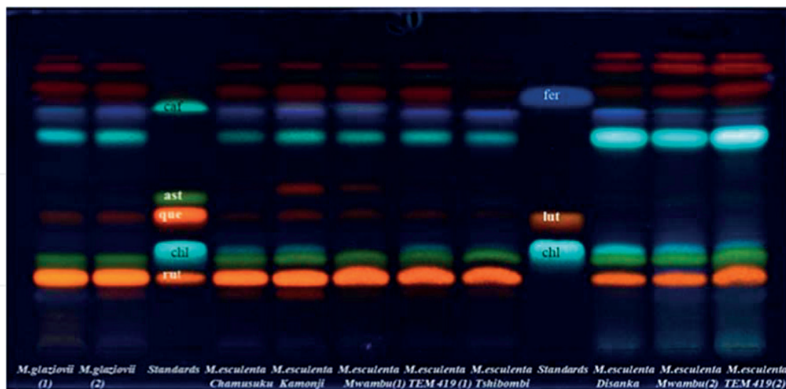
Figure 3. TLC chromatogram of methanolic extracts from M.esculenta (varieties: Chamusuku , Disanka , Kamonji , Mwambu , Tshibombi , TEM 419 ), M. glaziovii with astragalalin (ast), caffeic acid (caf), chlorogenic acid (chl), ferulic acid (fer), luteolin(lut), quercitrin(que) and rutin (rut) as standards; developed with ethyl acetate/formic acid/methanol/water (20:0.5:2.5:2; v/v/v/v) and visualized at 365 nm with natural products-PEG reagent. Flavonoids are detected as yellow-orange fluorescent spots and phenolic acids as blue fluorescent spots.

Leaves of Manihot esculenta and Manihot glaziovii contained amentoflavone, quercetin, quercetin-3-rutinoside, quercetin-3-glucoside, and kaempferol 3-rutinoside as flavonoids and caffeic acid, ferulic acid, gallic acid as phenolic acids. Cassava roots, cossettes and cassava flours contained phenolic acids, such as ferulic acid, as major compounds [8]. Hibiscus acetosella contained 2-O-trans-caffeoyl-hydroxycitric acid as major phenolic compounds and flavonoids such as quercetin-3-galactoside. Hibiscus cannabinus and Hibiscus sabdariffa contained neochlorogenic acid as major phenolic compounds and flavonoids such as quercetin-3-rutinoside, quercetin-3-glucoside and kaempferol 3-rutinoside ( Figure 4 ) [16].