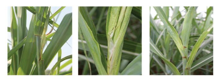
Grade 1: Chlorotic or generate slight etiolation symptom at the base of young leaves; slight shrinkage; very few irregular reddish specks or stripes.